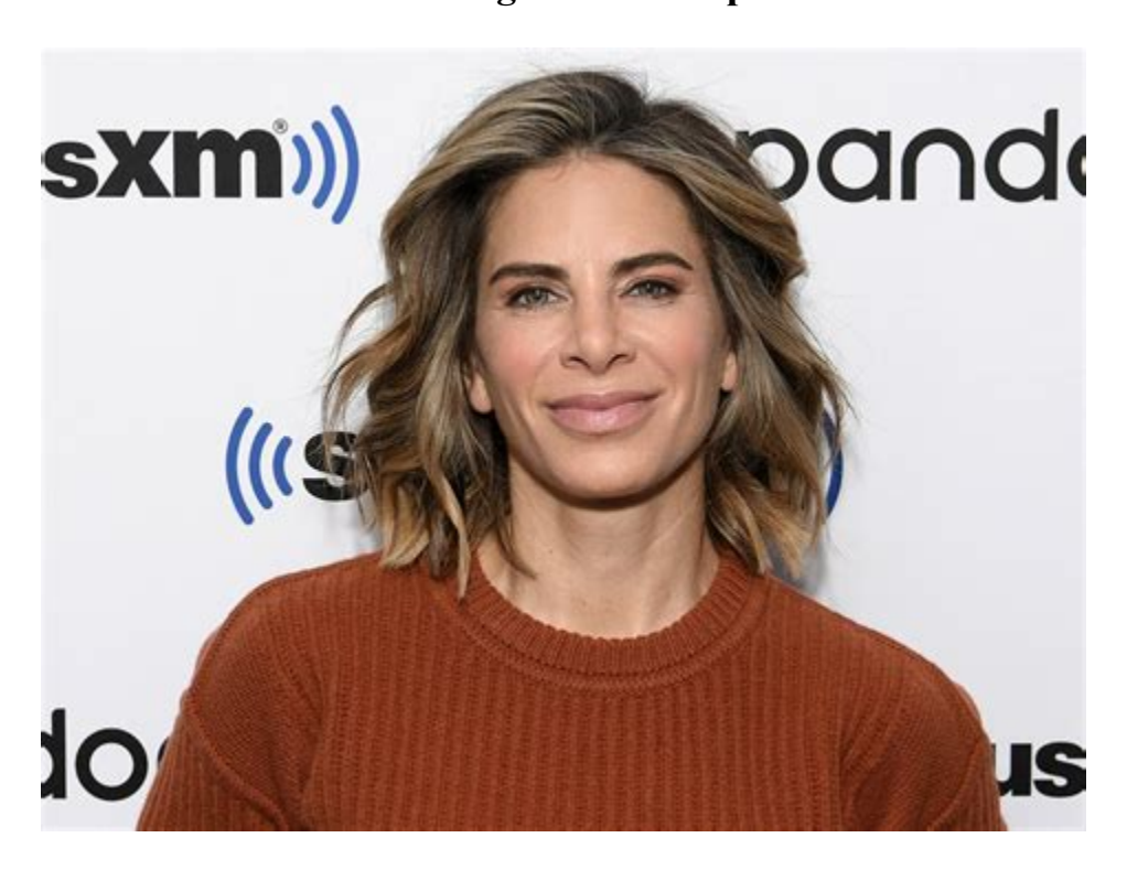
9 Summary 9. 1 References Winstrol-Only Cycle For Beginners Although we don't recommend Winstrol