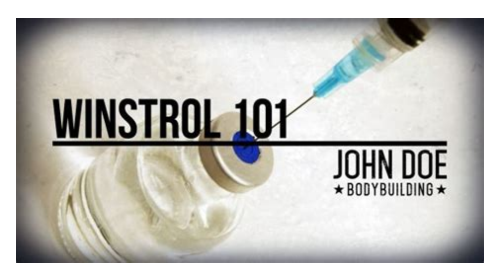
Winstrol 101: Everything You Ever Wanted To Know About Winni-V

1. Anavar for women 2. Winstrol for women 3. Clenbuterol for women If you are looking forward to lose weight without sacrificing your hard-earned lean muscle mass, you need to read this.