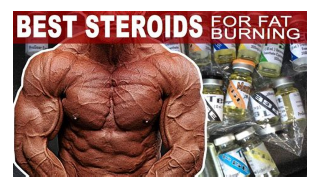
Top 5 Steroids for Weight Loss (Fat Loss) - Inside Bodybuilding

300 mg/week of Testosterone Propionate 1 serving a day of Joyful joints by Vital Labs (to keep joint pain down on Winny) 1 serving a day of a fat loss supplement Winstrol Cycle Weeks: 7 - 12 50 mg/day of Winstol Winstrol Post Cycle Therapy Begin HCG the day after your cycle ends.