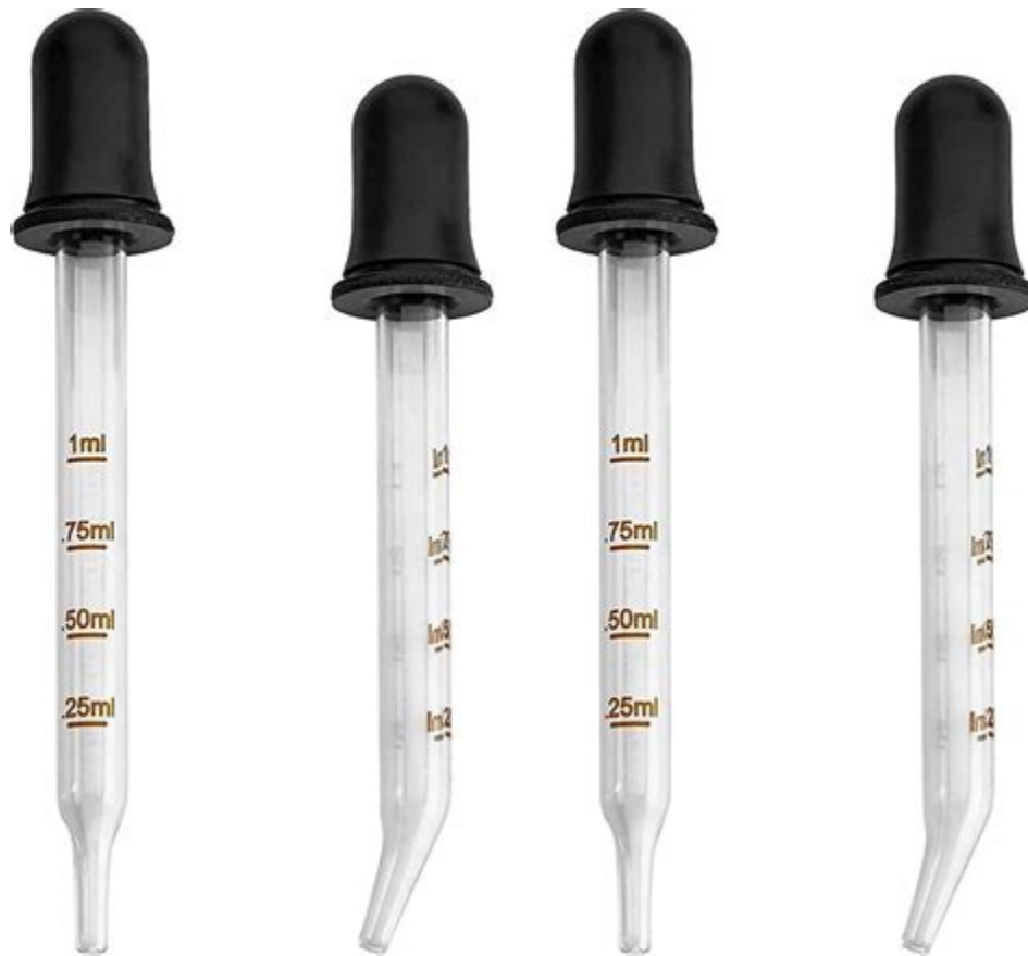
Table of Contents What Is Drop? What Is Milliliter? Is 1ml The Like 1 Drop? How Many Decrease In 1 ML? How To Convert Milliliters To Drops? How Large Is A Drop Of Water? How Much Is 1 ML In A Dropper For Baby? How Many Drops are in 1 ML of Syrup? How Many Drops Remain in 1 ML of Necessary Oil? Convert Milliliter To Other Volume Units