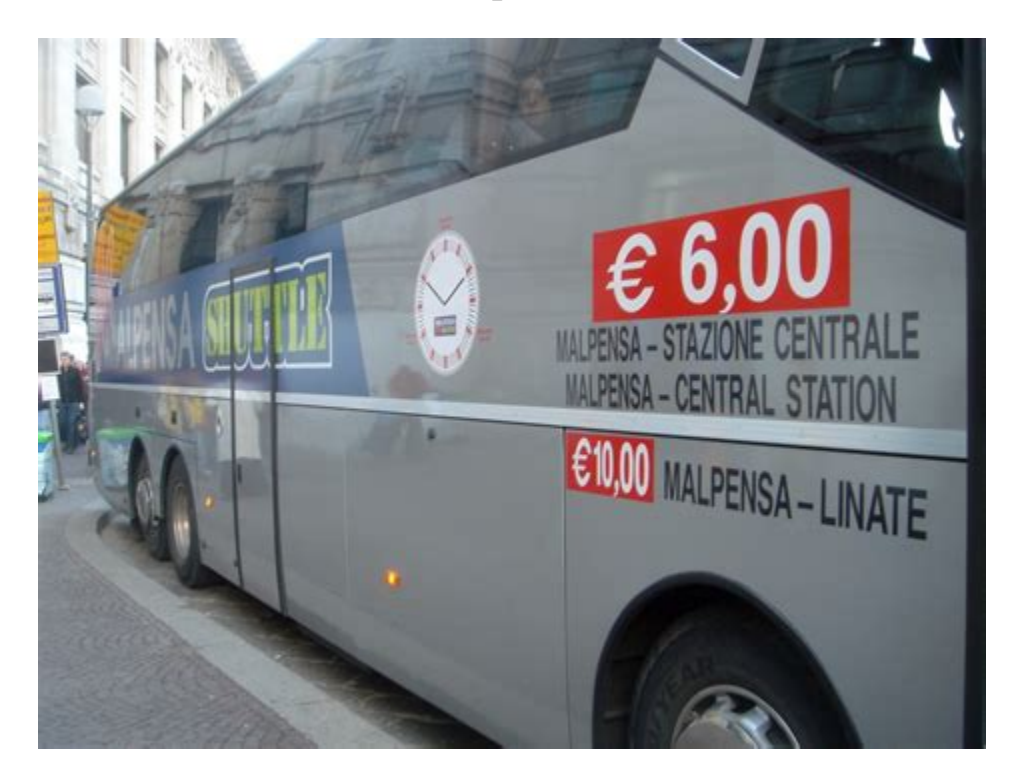
What are 'z' busses? - Milan Forum - Tripadvisor

#1 New to the site. . . Just bought some A/T xtreme tren z (tren,dmz stack). I got it off eBay. Just wondering what your take is on buyin it off eBay (scepticle)? I know I'm taking a risk, but has anyone had any luck? Can it be the real deal still? Has anyone had good results with tren z?