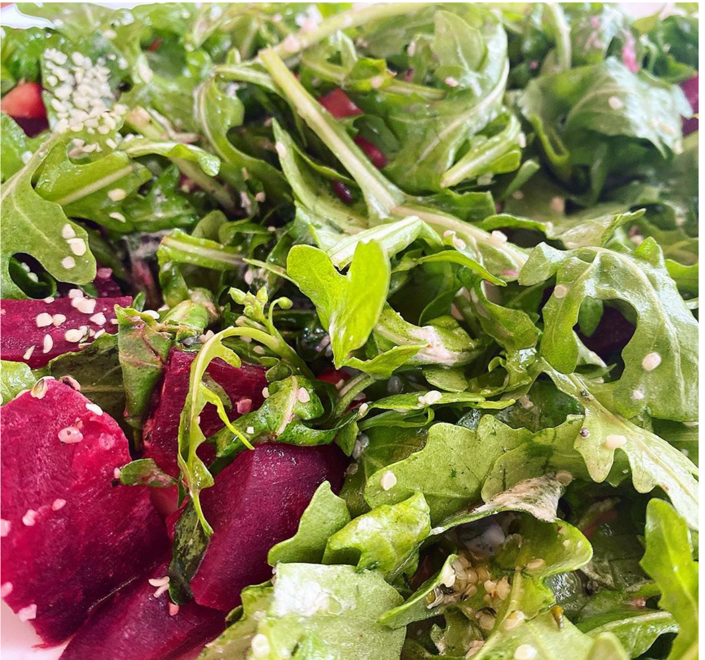
FOLLISTATIN 344 (1MG) BIO-PEPTIDE. Follistatin 344 is fascinating protein that can increase muscle mass beyond natural potential by suppressing myostatin. Scientists first identified follistatin while examining porcine follicular fluid in the ovaries.