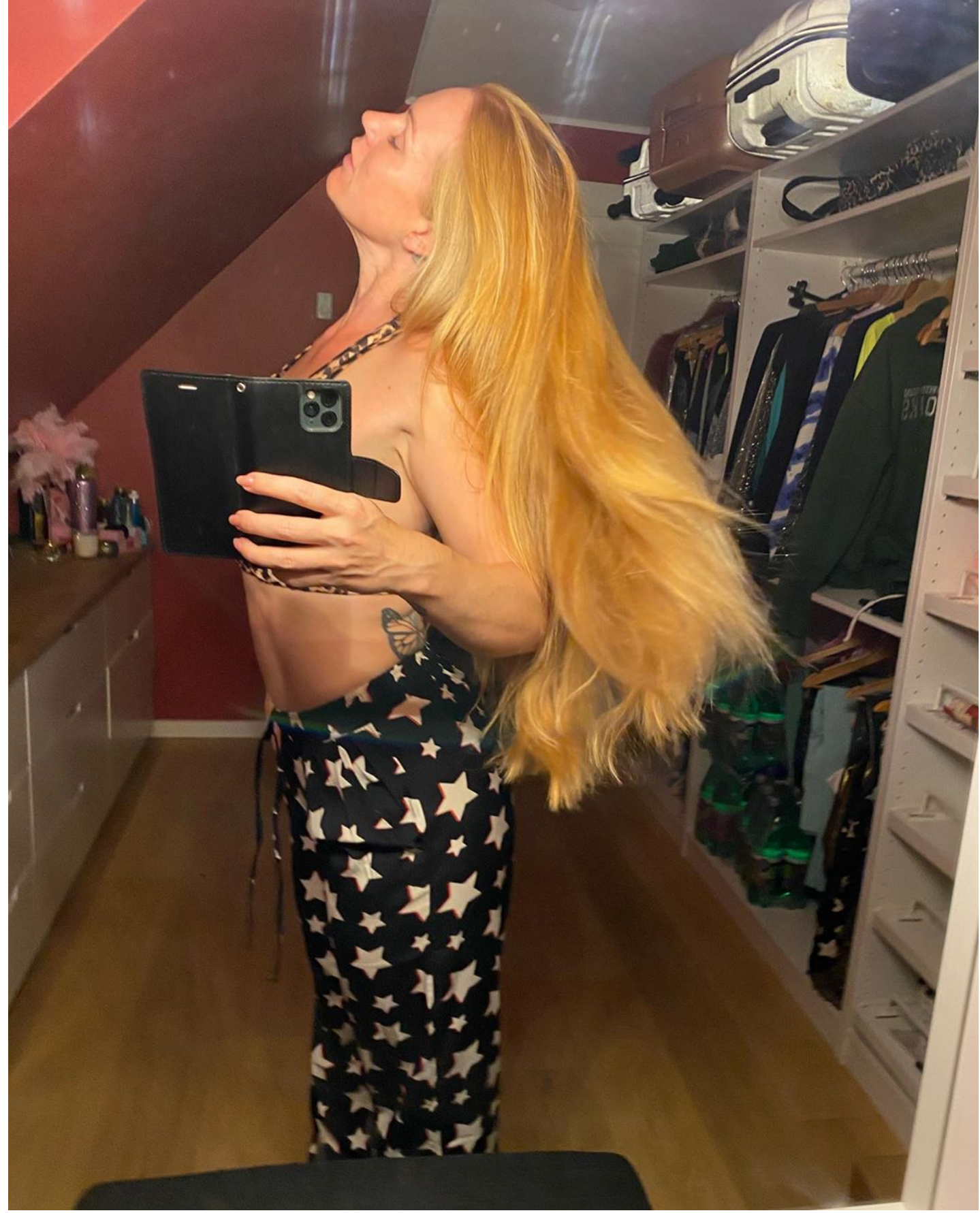
#trainhard #fit #gym #fitnessbrasil #personaltrainer #citius #trainerlink #resultado #workout #fitness #treino #gohard #food #meal #anabolism #muscle #mass - #regrann