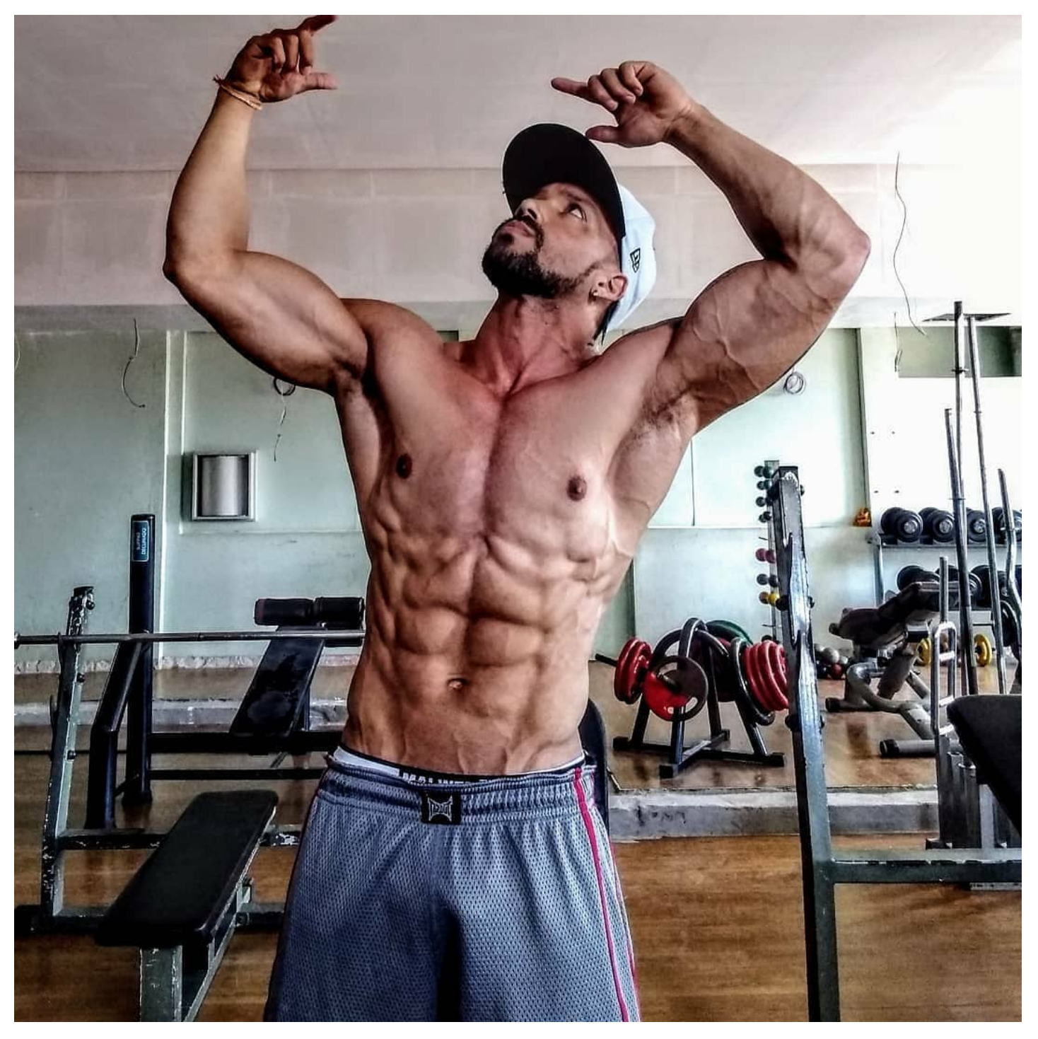
Nandrolone Decanoate is very popular anabolic and androgenic steroids. This genuine Nandrolone Decanoate product is manufactured by Norma Hellas and each ml of this product contains 100mg of this hormone. Nandrolone Decanoate is well known all over the world as Deca-Durabolin. Nandrolone Decanoate Norma is the most popular Nandrolone Decanoate product among amateur or professional athletes and ...