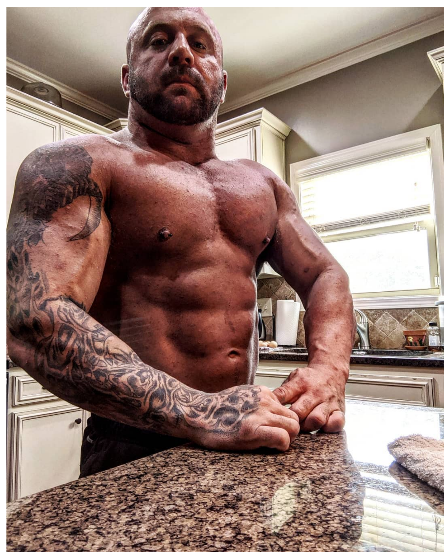
#bodybuilder #bodybuilderlife #bodybuildermotivation #befit #saturdaymotivation #armsworkout #musclebuilding #flex #bodybuildingdad #triceps #bodymotivation #workoutathome #selfmotivation #fitinspiration #bodyunderconstruction #biceps #personaltrainer #fitnessinstructor #physiquegoals #fitness #getshredded #nevergiveup #instadaily #1stplacefitness