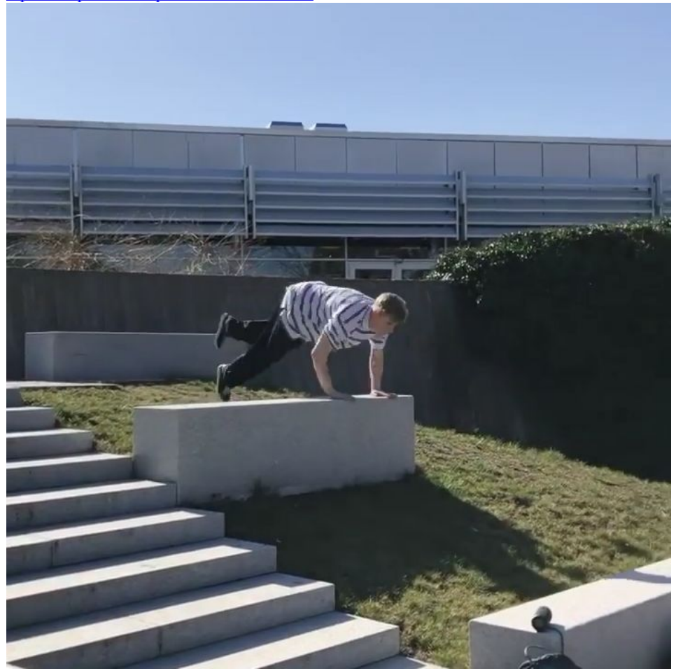
With the booming steroids market in the United Kingdom, one seeking to buy steroids UK must always be awake to the fact that there are commen trying to sell fake steroids in the market. If proper levels of vigilance are not observed, it is so easy to buy fake steroids whose consequences on the user's health may be detrimental.

https://www.pinterest.com/pin/652318327270070318/