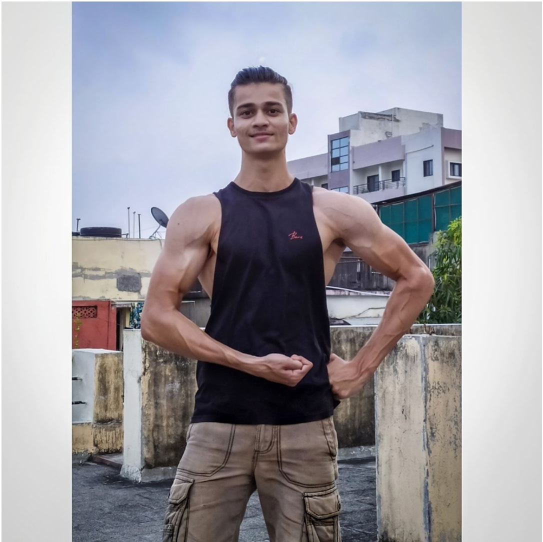
No decorrer da sua carreira Dallas acumula algumas indicações e prêmios na sua carreira, incluindo CyberSocket Awards 2020, GayVN 2018, 2019 e 2020, Raven's Eden Awards ganhador como Melhor ator e Melhor Musculoso em 2019 e outras 9 nomeações no ano seguinte, 2020 e XBiz 2017.

https://storymaps.arcgis.com/stories/23582c10065d439284180fd1b9c8f54