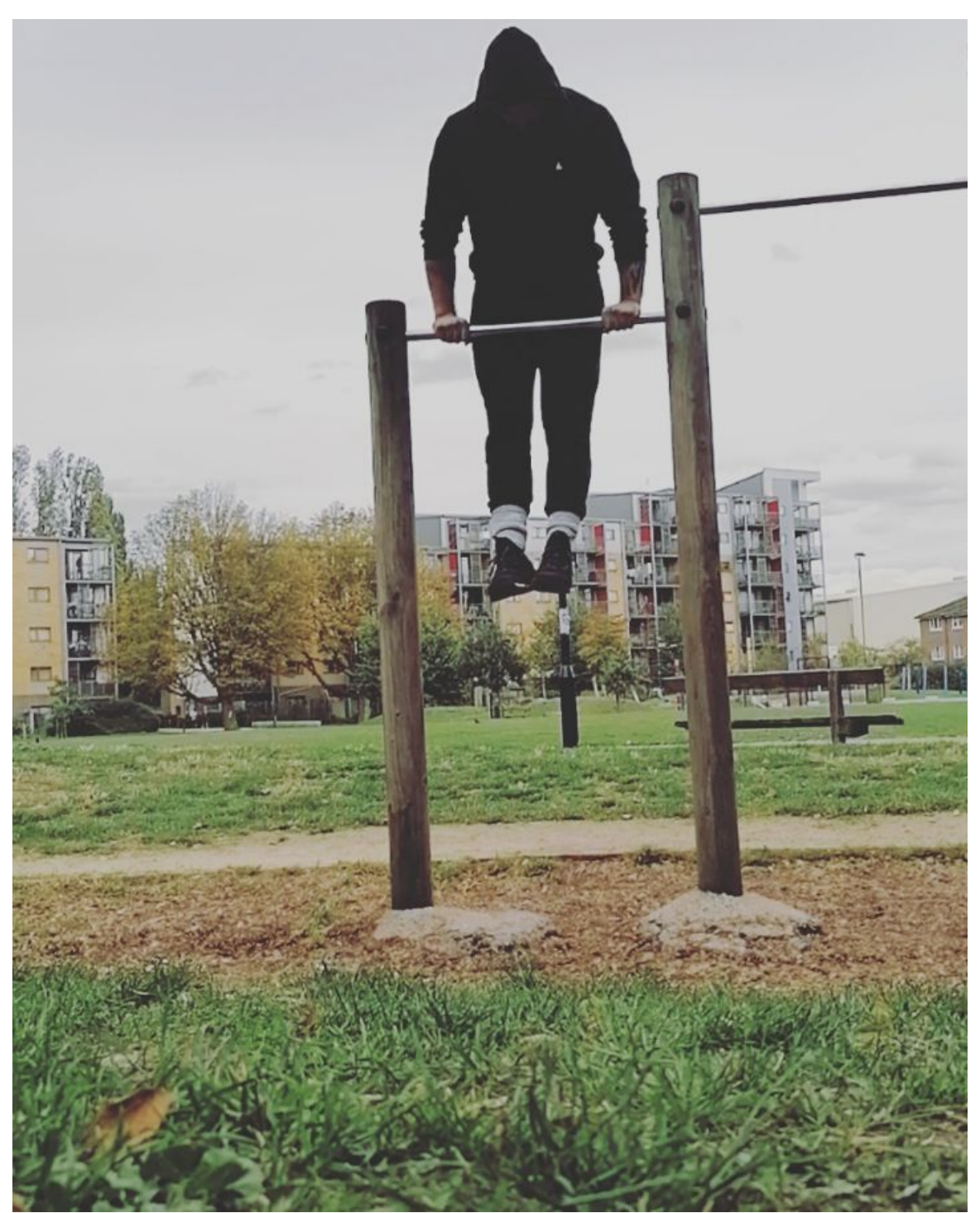
La vie commence au moment où tu es persuadé que tout est possible, tout se passeras dans ta tête, si tu décides d'abandonner ou de continuer, si tu décides de prendre les opportunités ou pas, si tu fais en fonction des autres ou de ton coeur.