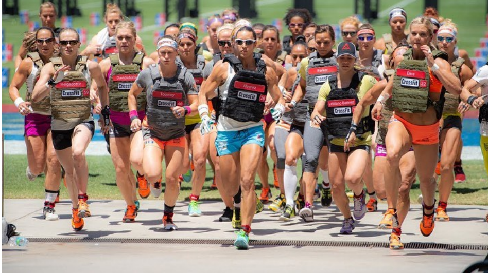
#squats #lunges #kettlebells #yogaeverydamnday #bodybuilding #instagood #instadaily #igers #fitnessmotivation #workoutmotivation #fitfam #yoga #crossfit #actorslife #calisthenics #lifestyle #photooftheday #fitness #likeforlikes #instafollow #core #training #picoftheday #getfit #fullbodyworkout

More than this, Deca and Winstrol is the best stack for joints, healing tendons and joints pains like no other steroid can do. An optimal dosage of Deca W instrol supplementation is around 200mg a week of Deca plus 25 mg a day of Winstrol. Many individuals do make such a cycle a 14 weeks length adding testosterone within the first weeks. #bomdiainstalândia #gmorning #inspo #inspiring #mood #goodvibes #mind #positiveenergy #motivation #lifestyle #loveit #fitness #crossfit #crossfit #box #crossfitAGD #details #savagebarbell #teamSavage #improveyourself #strongwomen #behealthybehappybefit #behappy #life #photolovers #photooftheday #igdaily #instagood