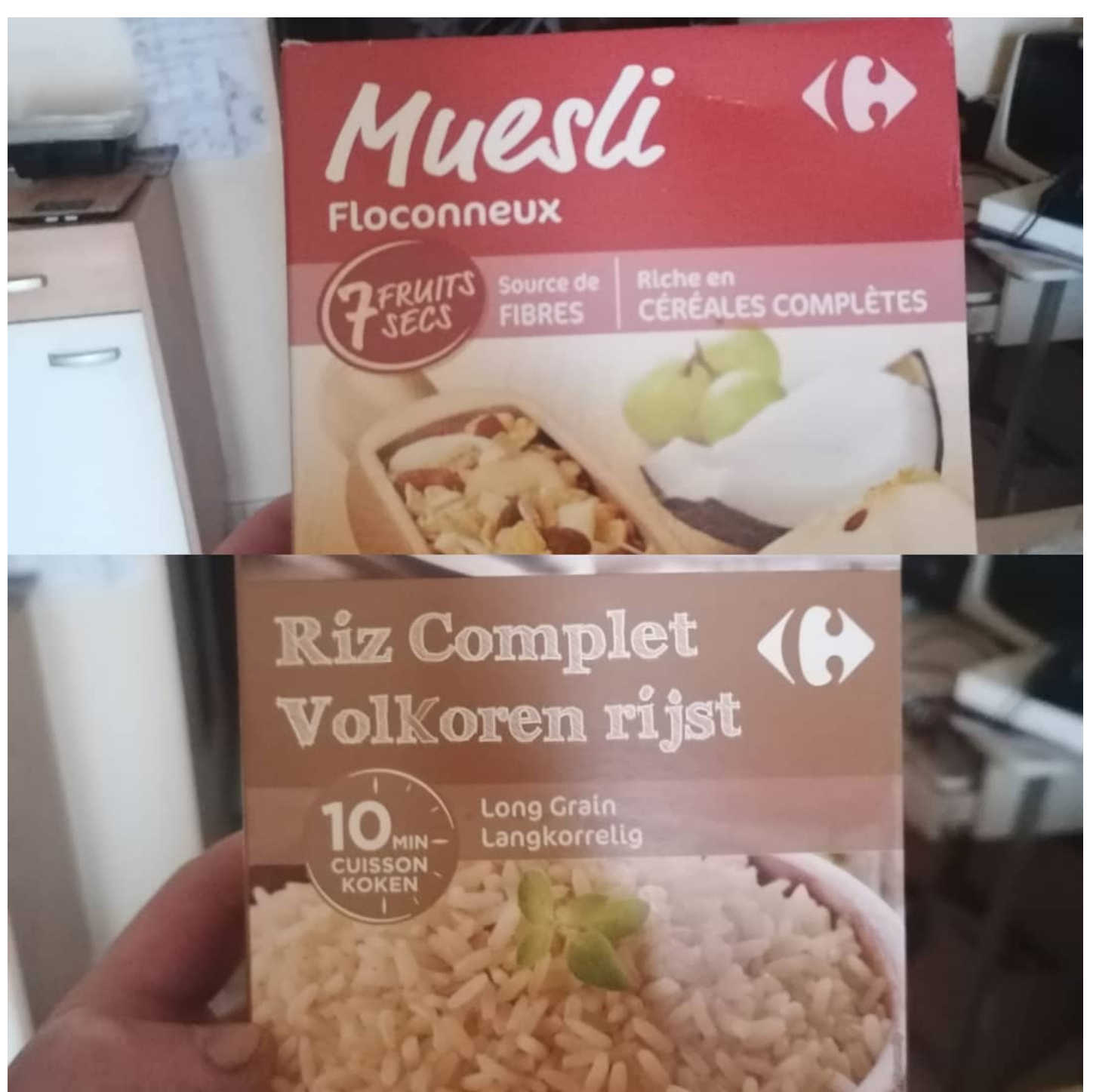
#qatar #qatari #qtr #qatarairways #ooredooqatar #doha_qatar #qatar_shopping #qatarinstagram #qatarfood #bodybuilding #qatarlife #dohaqatar #doha #qatarliving #visitQatar #qatar #qatar #qatargym #dohafitness #qgym #ladygym #qatarinsta #bodybuilder #healthyqatar #qatarbodybuilding #qatargym #qataruniversity #qatarfitness #fitnessqatar #dohafiashion 1171