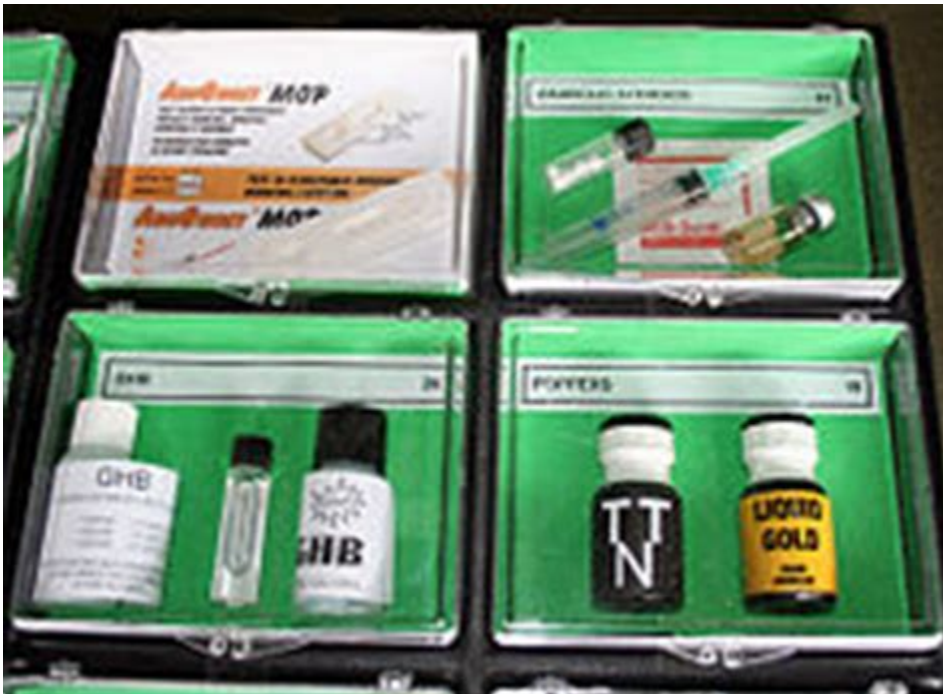
Muscle Labs USA

products that can boost your progress without having any risks. We've seen many Muscle Labs USA reviews that show users that have made amazing progress while using their ... Muscle Labs USA Reviews.