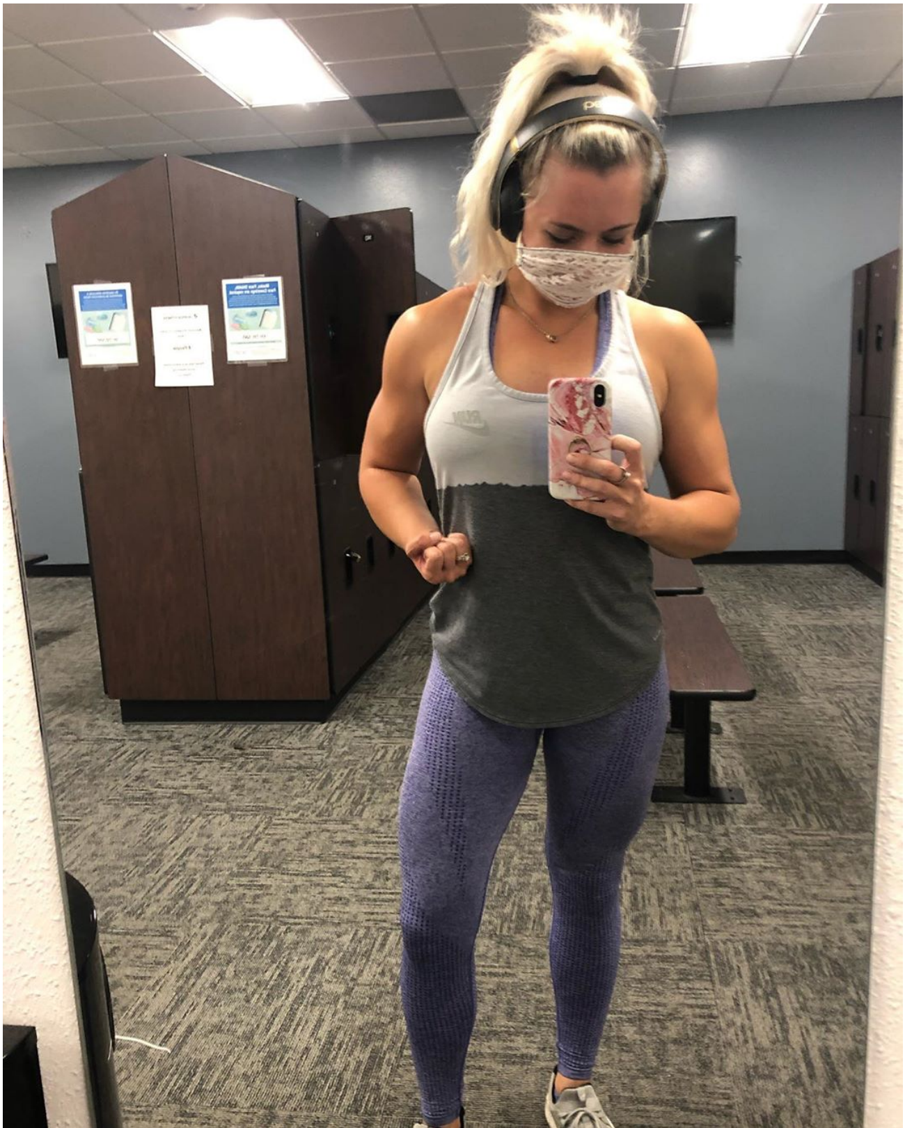
#usaw #weightlifting #usaweighting #olympicweightlifting #northdakotaweighting #wchswweightlifting #wchswl #coacheswholift #wchsathletics #wchswolves #snatch #cleanandjerk #squat #athlete #athletic #fit #fitness 937