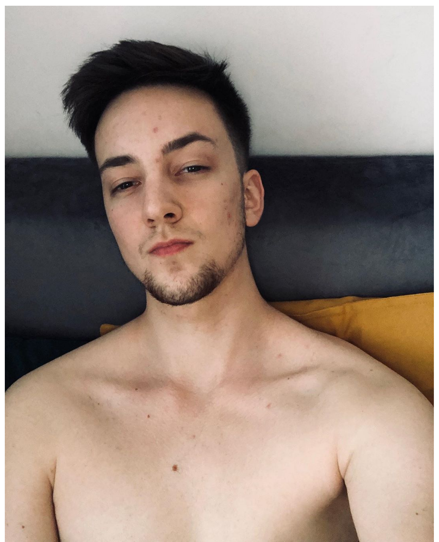
#lifting #liftingweights #tagstagram #liftingmotivation #liftingmemes #tagsta #liftinglife #deadlifting #tagstagramers #fitness #liftingheavy #liftingshoes #liftingladies #crosslifting #liftingislife #olympiclifting #weightlifting #weights #workout #lift #heavylifting #liftingmom #liftingweight

https://mndepted.instructure.com/eportfolios/7011/Home/Clenbuterol_Cena_V_Lekarni