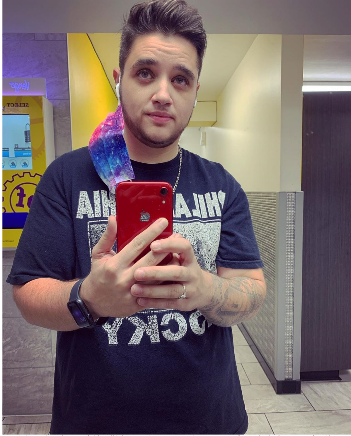
We can let the negativity seep in or we can feed the positivity in every situation we come across. It's how we choose to talk to ourselves that allows us to move forward in a

positive direction. [5] NovoRapid Penfill 100 units U/ml solution for injection in cartridge. ... whereas the potency of human insulin is expressed in international units (IU). NovoRapid dosing is individual and determined in accordance with the needs of the patient. It should normally be used in combination with intermediate-acting or long-acting insulin.