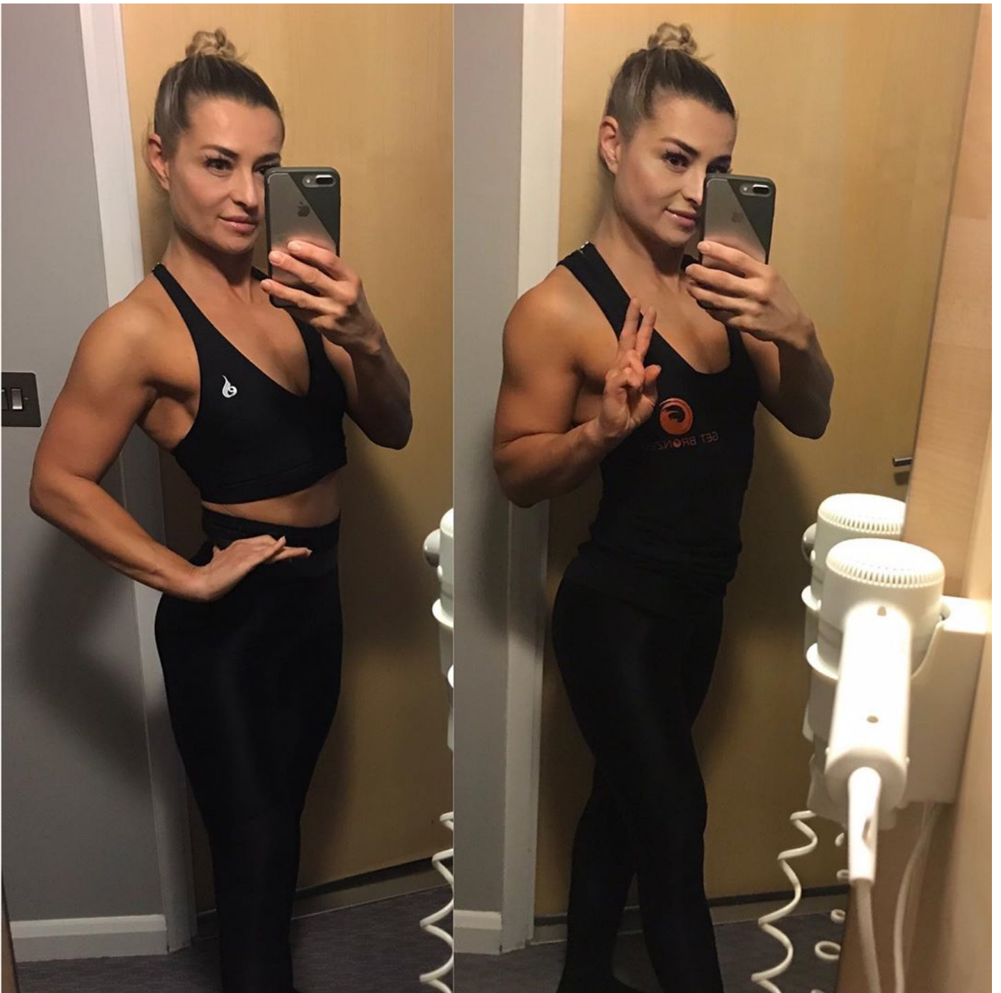
Testosteron kopen in Nederland en België. De Apotheeker is dé website om online veilig, gemakkelijk, discreet en snel Testosteron en anabolen kopen.