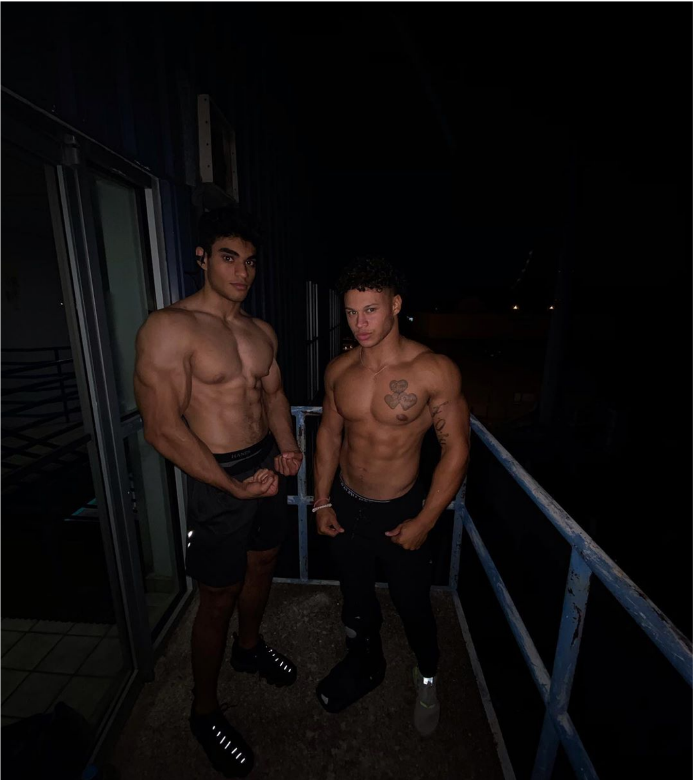
The Winstrol steroid has been the subject of in-depth coverage by the media. Part of the reason that Winstrol has been so heavily documented is the fact that it is one of the first steroids invented. It has been in existence in the 1950s. Like most other steroids, Winstrol is just a name brand for a generic form of the substance.