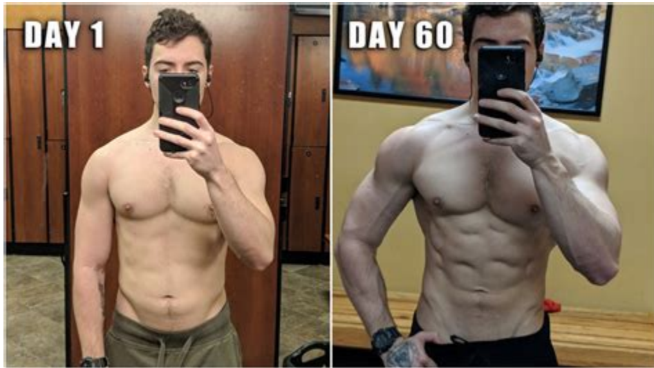
Table of Contents show Introduction to MK-2866 and LGD-4033 MK-2866 and LGD-4033 are both SARMs (selective androgen receptor modulators) that have gained popularity in the fitness and bodybuilding community for their muscle-building and performance-enhancing properties.