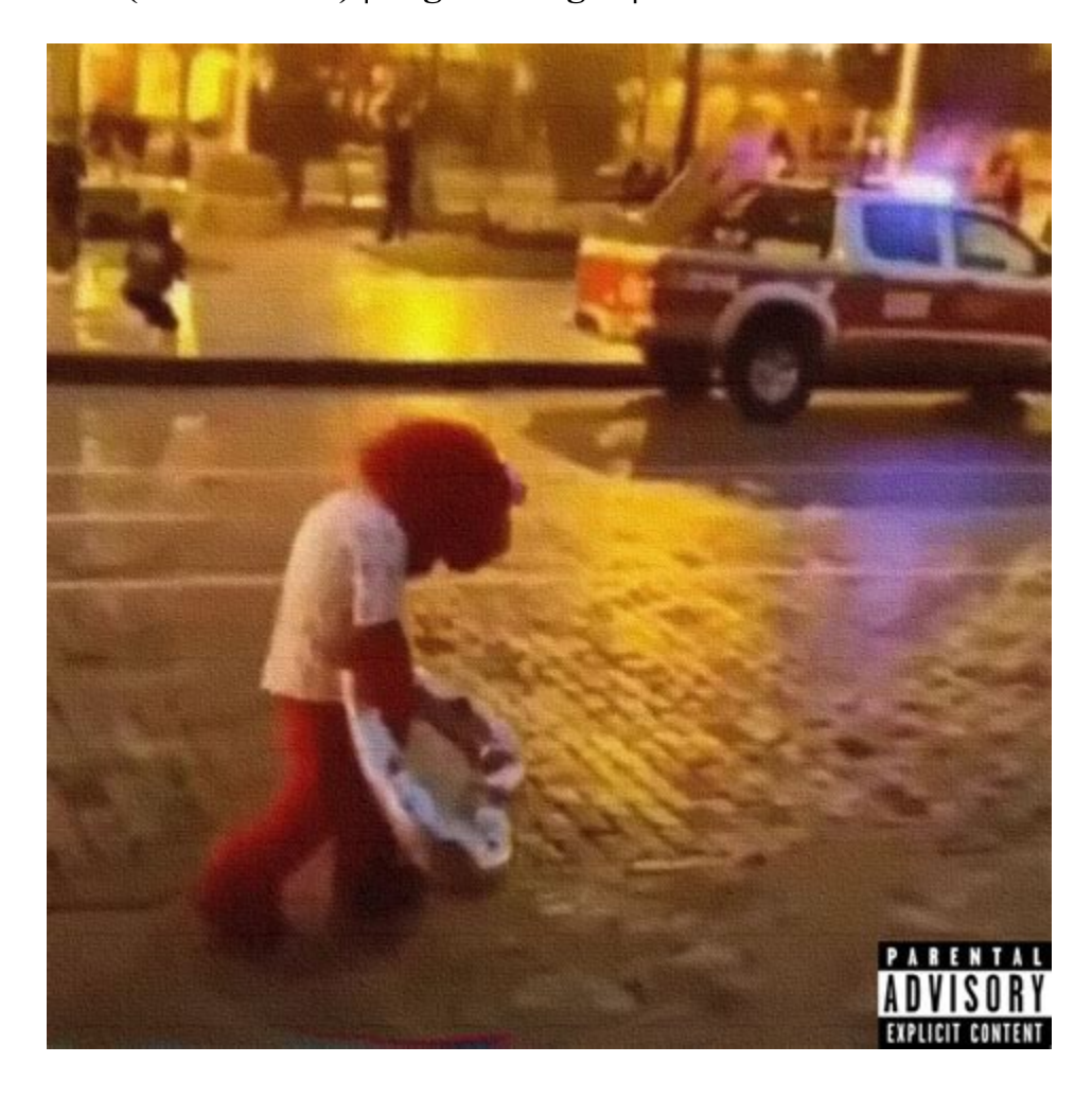
$ 79. 99 Add to cart View Lab Reports Free Shipping US $100+ | International $275+ Description Additional information Lab Reports Reviews MK-677 Ibutamoren Solution 25mg/ml - 50ml MK-677 2. 5% solution. High affinity ghrelin receptor agonist (pKi = 8. 14).