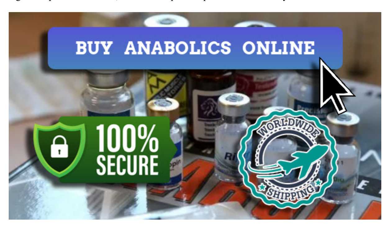
Ϋ́?Ϋ́?Ϋ́? CHECK OUT OUR STORE Ϋ́?Ϋ́?Ϋ́?

UKRAINE. Kyiv is the ultimate prize for Russia: the heart of Ukraine, and the seat of a government it has sought to replace. For weeks, Russian troops have pressed in on the city from both sides .