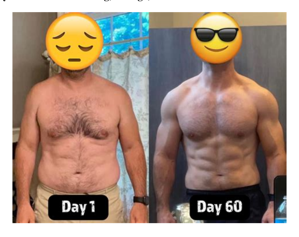
MK 677 Cycle Guide - How Long, Dosage, & More - mk677

July 19, 2023 0 MK 677 is a new compound making waves in the anti-aging and fitness communities. Also known as Ibutamoren, MK 677 is gaining popularity as a protocol designed to enhance the body's production of Human Growth Hormone (HGH). Many newbies confuse MK 677 as a Selective Androgen Receptor Modulator (SARM).