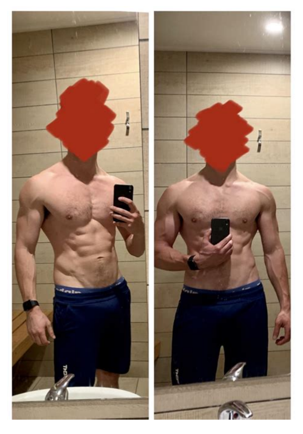
MK677 and PCT MK677 vs SERMs for PCT. Indeed, a lot of people start to use MK-677 (Ibutamoren) as a compound for Post Cycle Therapy (PCT) protocols and there are several reasons. Many people either add MK-677 to the standard PCT medications such as Nolvadex (tamoxifen) or Clomid (clomiphene) or use it as an alternative for these compounds.