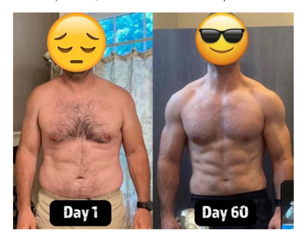
MK 677 (Ibutamoren) Review, Before And After Results | December 2023

Many individuals are considering MK 677 as an alternative to traditional post cycle therapy (PCT) supplements. One of the main reasons is its fewer side effects compared to other PCT options. MK 677 can also be used for longer periods without suppressing testosterone or estrogen levels, making it a potentially safer choice for extended cycles.