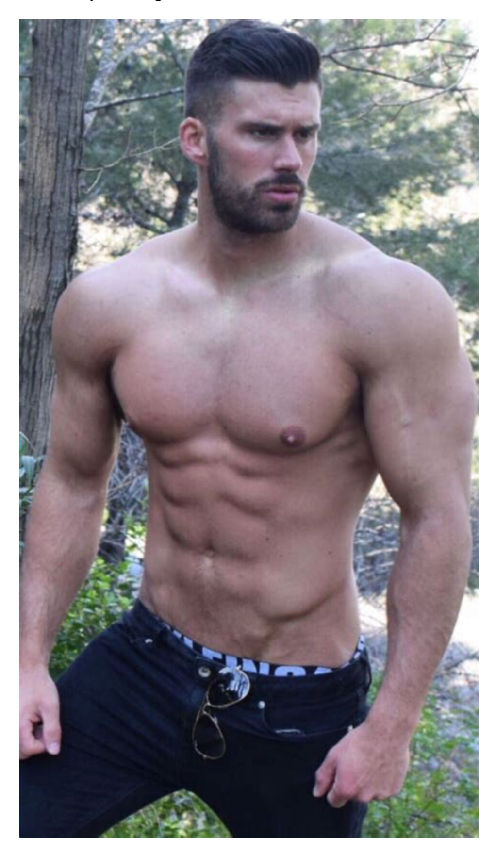
nipples reducer - Bodybuilding Forums