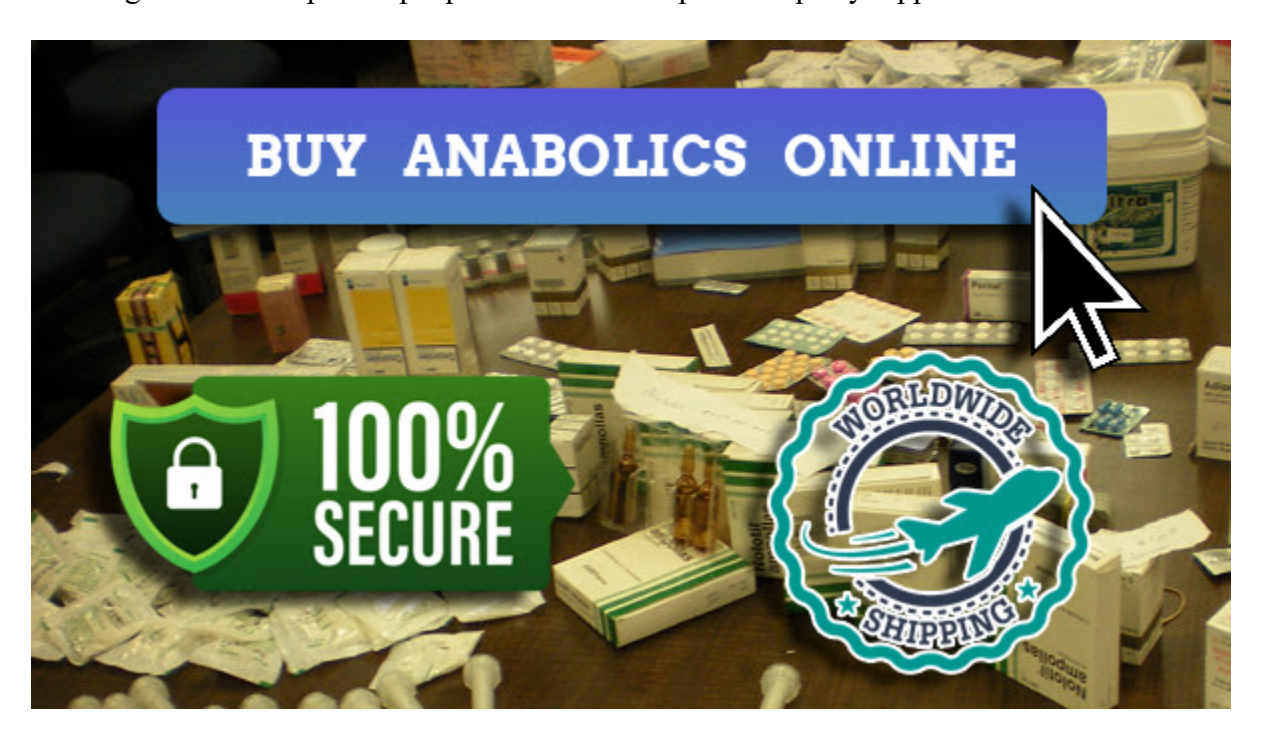
3 4 5 SHOP OUR ONLINE STORE 5 5 5 5

As puffy nipples are often a cosmetic concern, some people only require reassurance and counseling. The following are some steps that people can take to help reduce puffy nipples. 1.