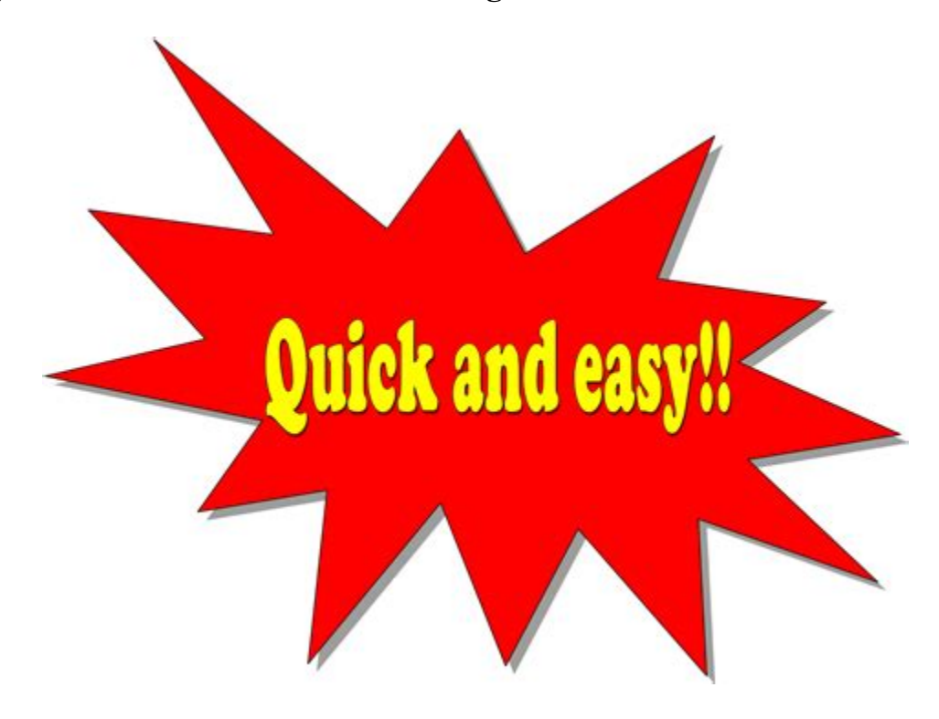
Fast, Easy & Hassle-Free Blood Lab Testing - Private MD Labs

Modified on: Wed, Dec 20, 2023 at 6:04 PM Select your test and place your order online for the tests you want performed. You will immediately receive an email confirming your order. If you don't see it in your inbox, check your junk box.