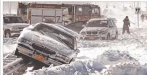
More than 30 cars were stuck overnight along Necessary Highway on Long Island. CRASH/ROADWAY Full page of snowstorm coverage, A4

Snowfall A howling storm swept through the Northeast, dropping as much as three feet of snow and leaving about 650,000 without power. Although severe, the storm was not as dire as the Blizzard of 1976, often held as a benchmark.