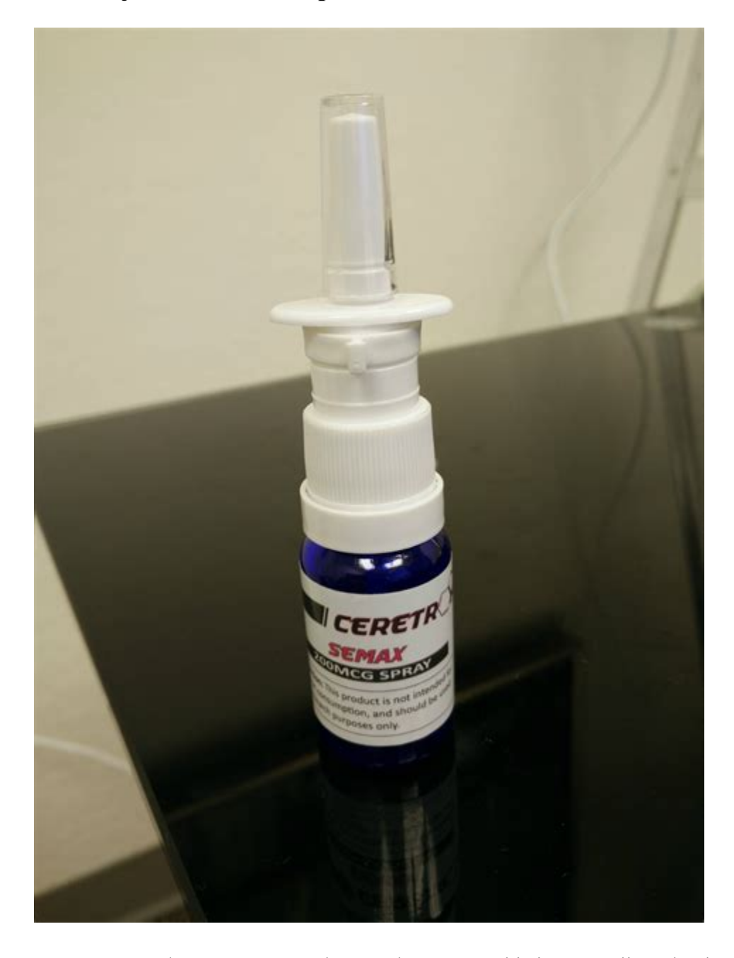
Semax - Nasal vs. Injection: r/Nootropics - Reddit

20 u/Weird_Pepper4738 • 14 days ago Anyone know where to get this in Australia? Thanks 1 Share u/Cultural-Rate4096 • 18 days ago I feel like SEMAX is curbing my social media addiction I'm taking 20mg of SEMAX for a couple of days now and I've noticed my addiction to social media is decreasing.