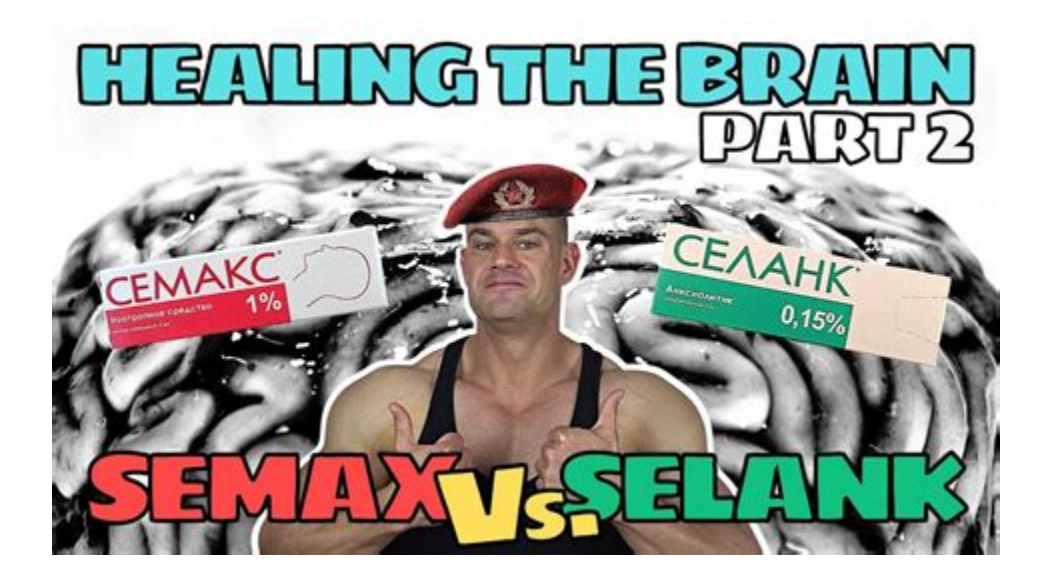
SubQ vs. Nasal Semax/Selank?: r/Nootropics - Reddit

8 comments Best CallMeMrDillinger • 6 yr. ago I've never used Semax as nasal, just SubQ. I've read many people who have used the nasal route tend to have better results in terms of cognition, but I've yet to try it. With SubQ I've never re-dosed, in fact, I wasn't even regular with my injections.