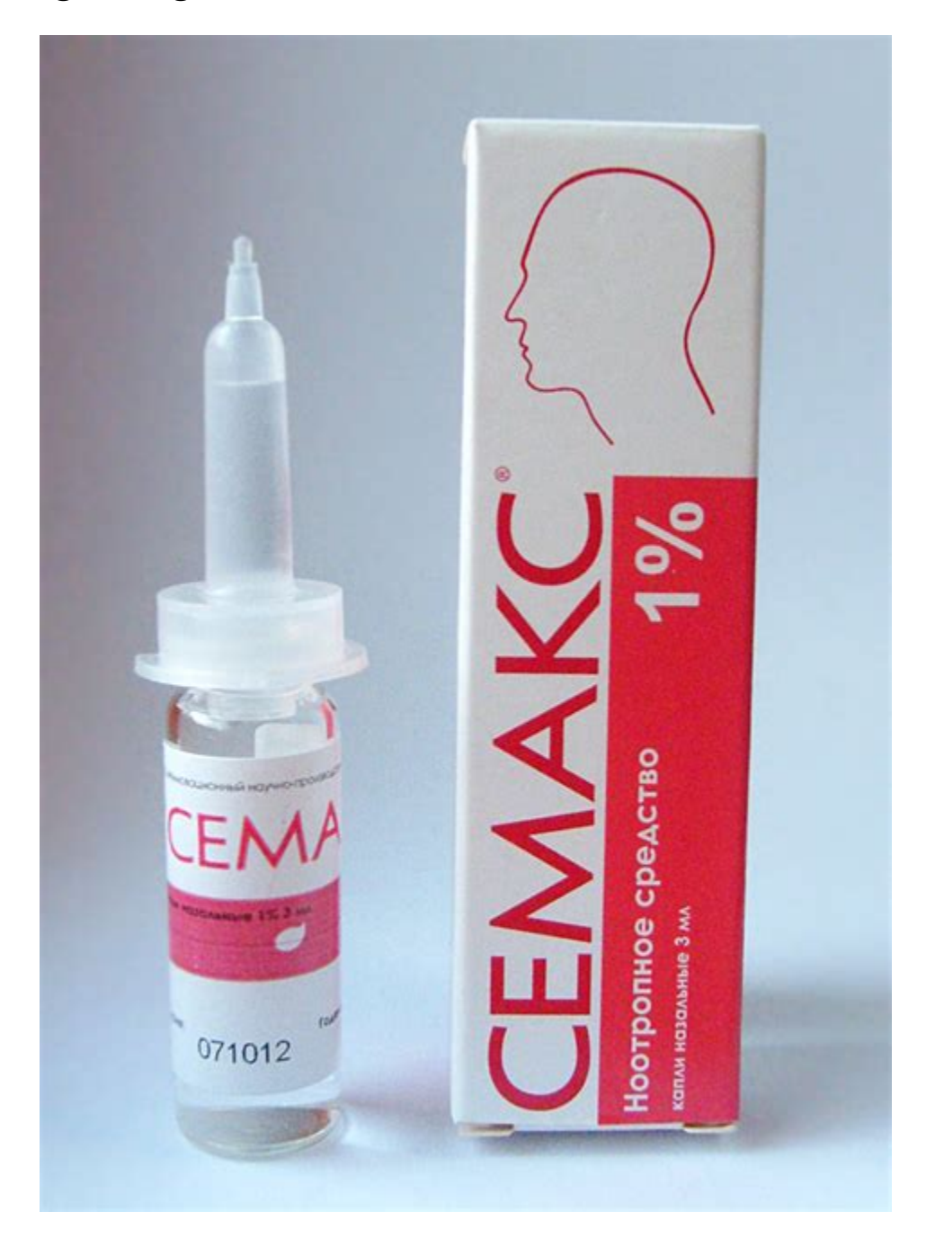
Semax - Dosage & Cognitive Effects - The Revisionist

Other stress studies on rats come to similar findings that Semax has a dose dependant stress-limiting effect. One way it modulates the stress response is by changing the composition of colon .