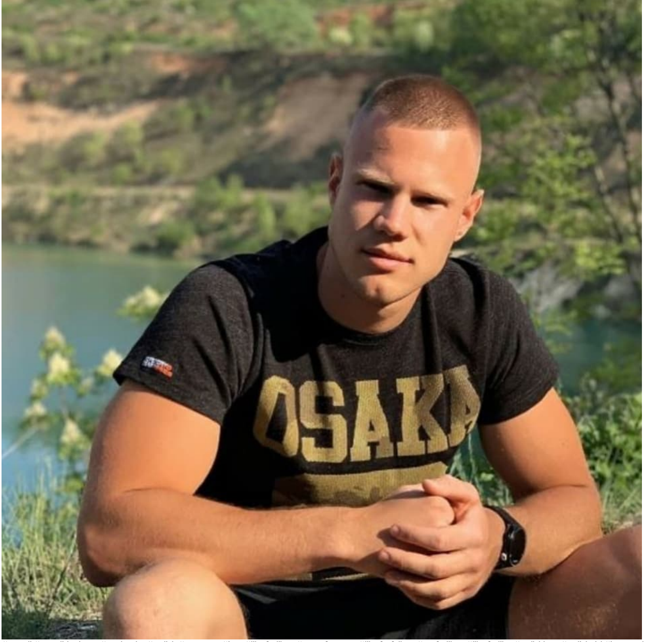
#napoli #napolidavivere #starbucks #polish #vscocam #iger #likeforlikes #spamforspam #likeforfollow #tagforlikes #likeforlike #polishboy #polishgirl #istagood #istapic #models #likeforfollowers #likeforfollow #followforlowback #followforlike #followteam #followteam #likebackteam #gym #body #fit #fitness #muscle #squat #power #muscle #champagne #napoli #posillipo

Drostanolone Propionate Swiss Remedies. This drug is composed of active drostanolone propionate substance. Has the same features that the testosterone, but has very little effect on the liver and the kidneys, not is toxic. After the couple injection felt the effects of this medication. It helps to relieve fatigue after exercise.