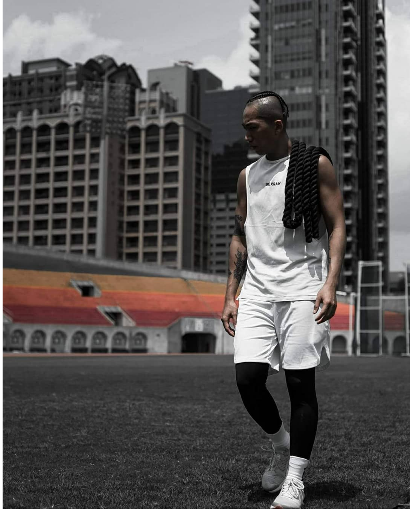
#bodybuilding #bodybuilder #bodybuilder #bodyfitness #weightloss journey #weightloss #weightlifting #weights #training #train #cardio #nutrition #lats #shredded #back #unrivalednutrition http://cenejyd.org/forums/topic/alpha-pharma-deca/