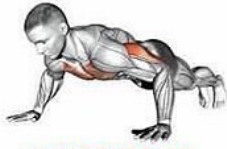
WIDE PUSH UP 3 SETS | 10-15 REPS