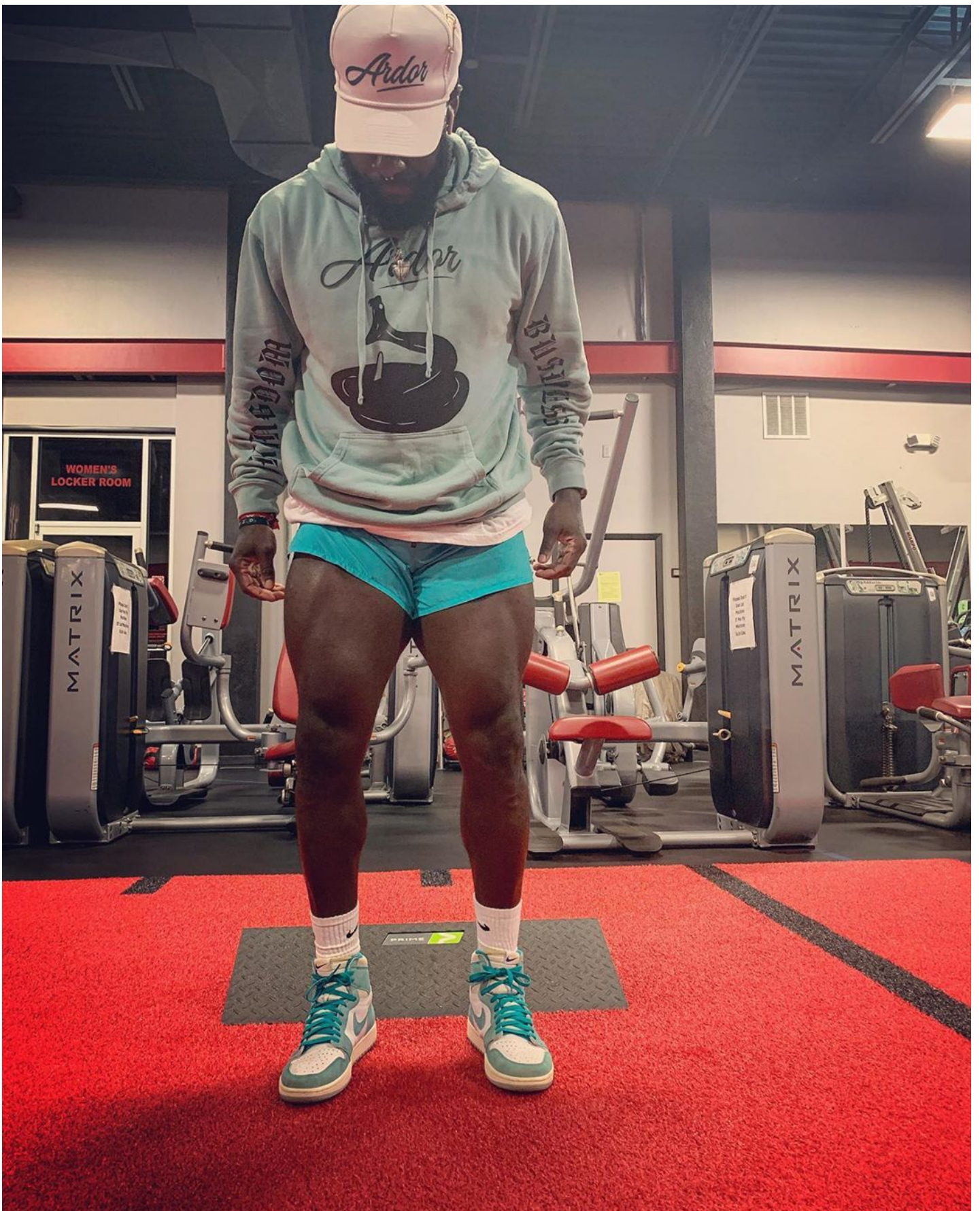
A little of today's work. I've been having great workouts feeling stronger and seeing how much i can do now that I couldn't before is a great feeling or hardwork and consistency paying off. And yep I had to include a still shot of that quad muscle and those legs developing in working hard for this and I'm proud of it #lets go #truefitphysiques #workhard #discipline #consistency #stronger #muscles #legs #goals #fitmom #fitfam #fitness #fitnessjourney #mywork #progress #fitspo #instafit #fitstagram #fit #fitgirls #happy #healthy #jacksonville #florida #explore #explorepages #duval #exploremore #fitwomen #captainamerica