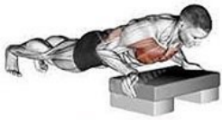
INCLINE PUSH UP 3 SETS | 10-15 REPS