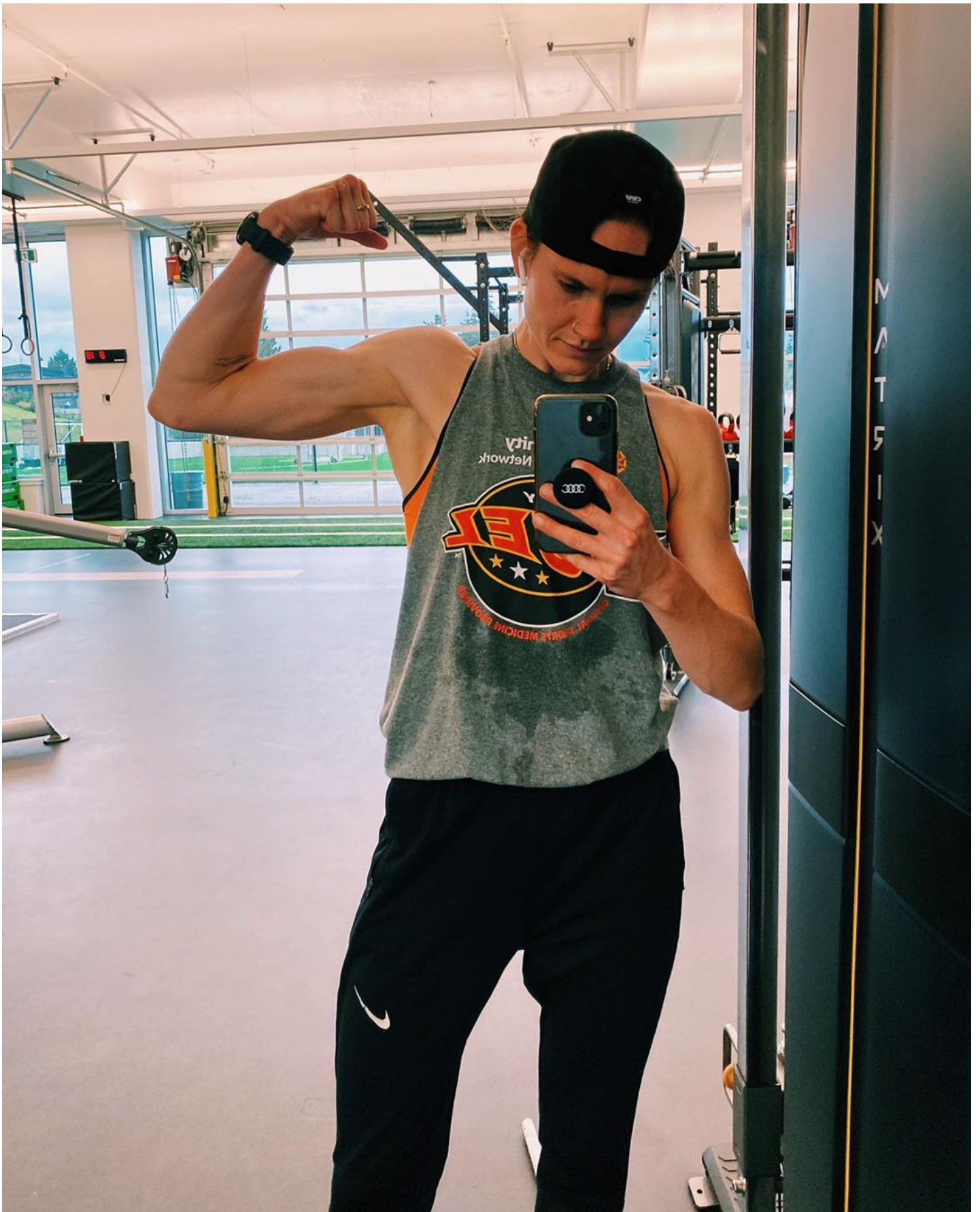
"I was under depression and stress and for me to embark on this journey was more of a therapy in the form of workout.