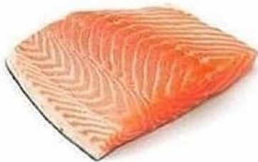
ENANTATO DE SALMÃO