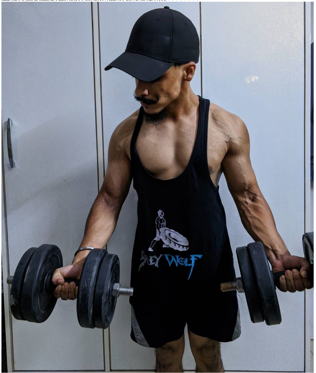
#fitness #gym #workout #fit #fitnessmotivation #motivation #bodybuilding #training #health #fitfam #lifestyle #love #sport #healthy #healthylifestyle #crossfit #gymlife #instagood #personaltrainer #exercise #muscle

I really hone in on that mind to muscle connection to ensure I maximise this pre-workout. FINALLY got over my irrational fear of filming at the gym-hope you liked the video! Being swamped with uni and work is not ideal but I'll film as much as I can!! HAPPY SUNDAY! ALL MY LOVE AS ALWAYS