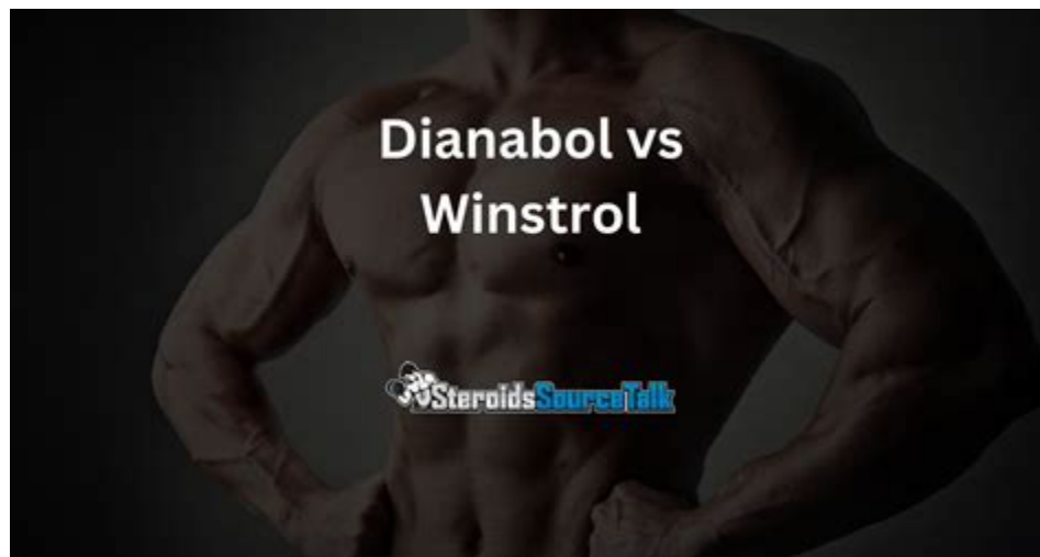
Table of Contents show Dbol vs Winstrol Comparison table Dianabol and Winstrol Comparison table Winstrol vs Dianabol - Overview What is Winstrol? Winstrol is a brand name for the synthetic drug Stanozolol. It's a man-made steroid that has similar effects to testosterone.