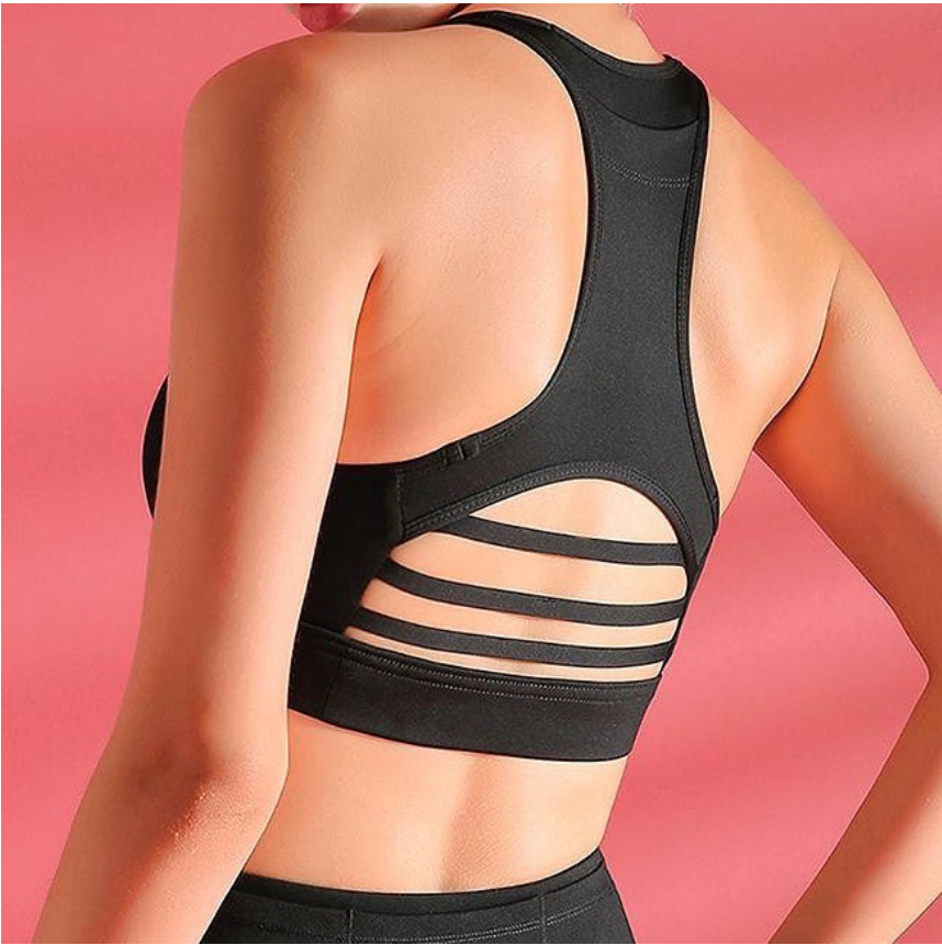
#legpress #legday #workhard #work #workout #weightlifting #gambe #gymfever #workoutoftheday #allenamento #460kg #bull #bear #man #gymlife #instagym #muscles