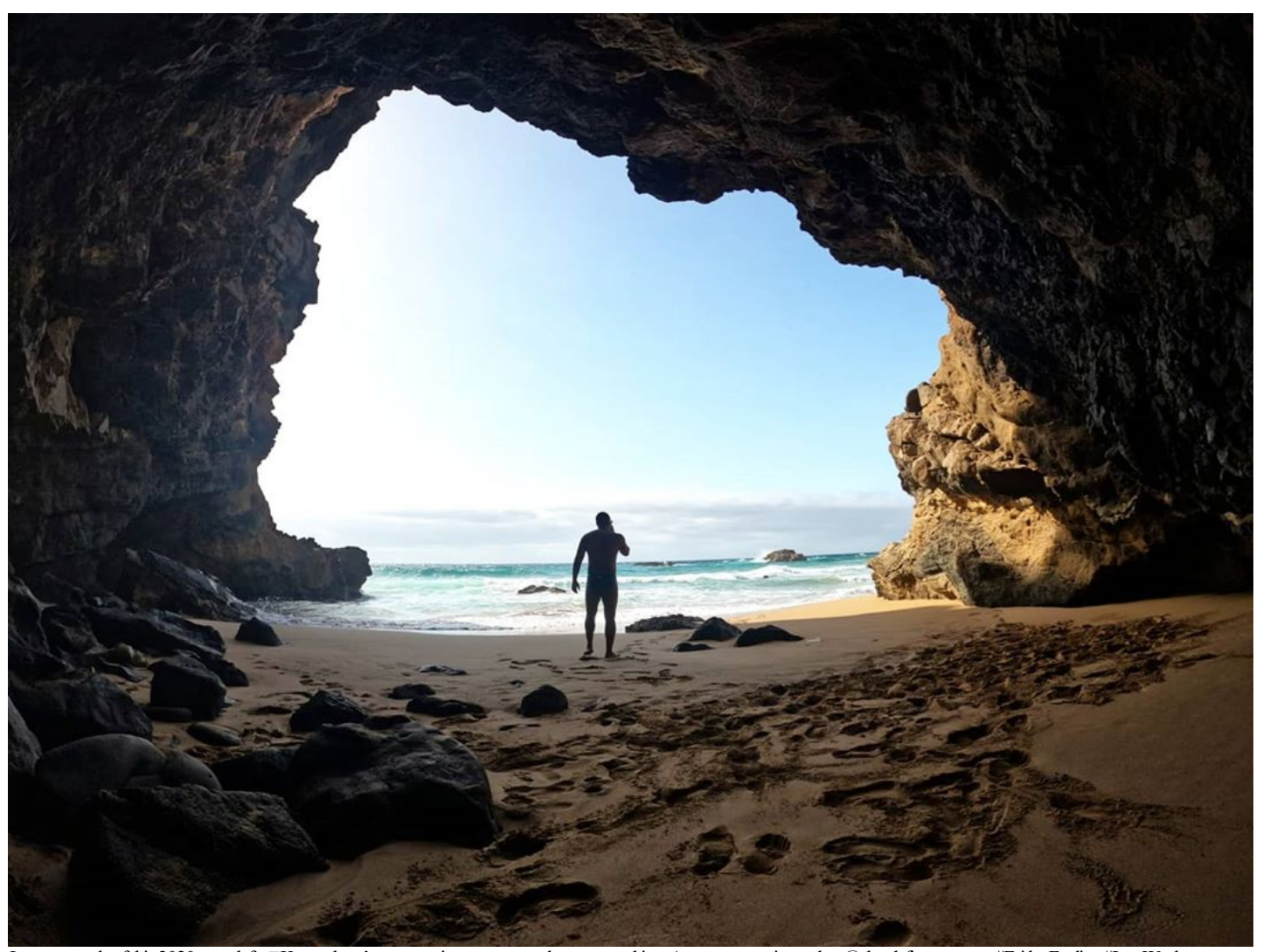
Just one week of this 2020 prep left. \square Know there's room to improve so we keep on pushing. Awesome session today @shredzfitnesscentre #FridayFeeling #LetsWork #MensPhysique #NattyShred