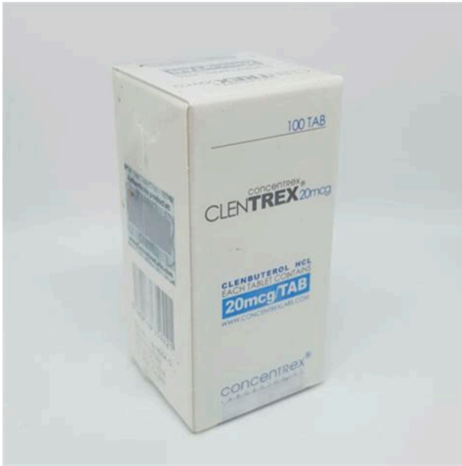
Testosterone Enanthate (Test

E) 250mg/10ml - Muscle Mass & Strength $ 65.00 - $ 125.00 Buy Testosterone Enanthate (Test E) 300mg/10ml By Sky Pharma And Other Steroids For Sale At Online. PHARMA TEST E300 Buy PHARMA TEST E300 (Testosterone Enanthate) 300mg/ml 10ml Pharmacom Labs. PHARMA TEST E 300 (Testosterone Enanthate) is one of the best mass building anabolics known to man and is a highly recommended as the base of any mass building cycle.