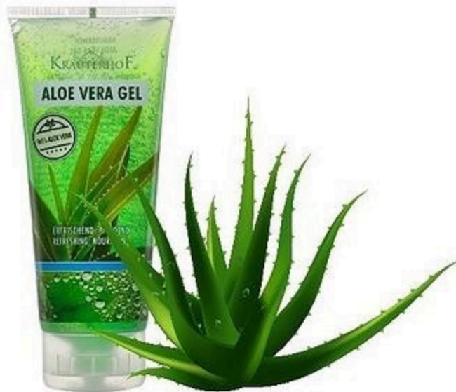
ALOE VERA GEL (Freskues dhe Ushqyes)

clenbuterol weight loss good or bad clen t3 side effects how to take clenbuterol and cytomel clenbuterol buy now australian wanda price in pakistan australian dollar indian rupee exchange rate