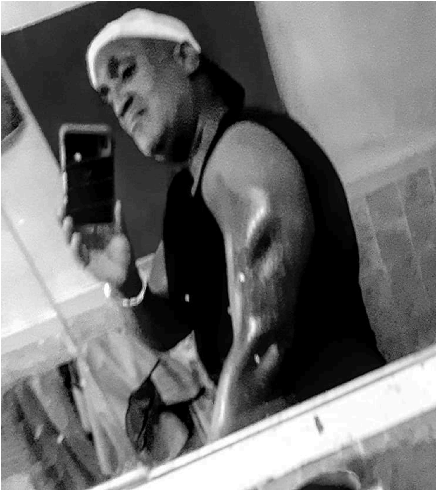
winstrol tren test prop cycle