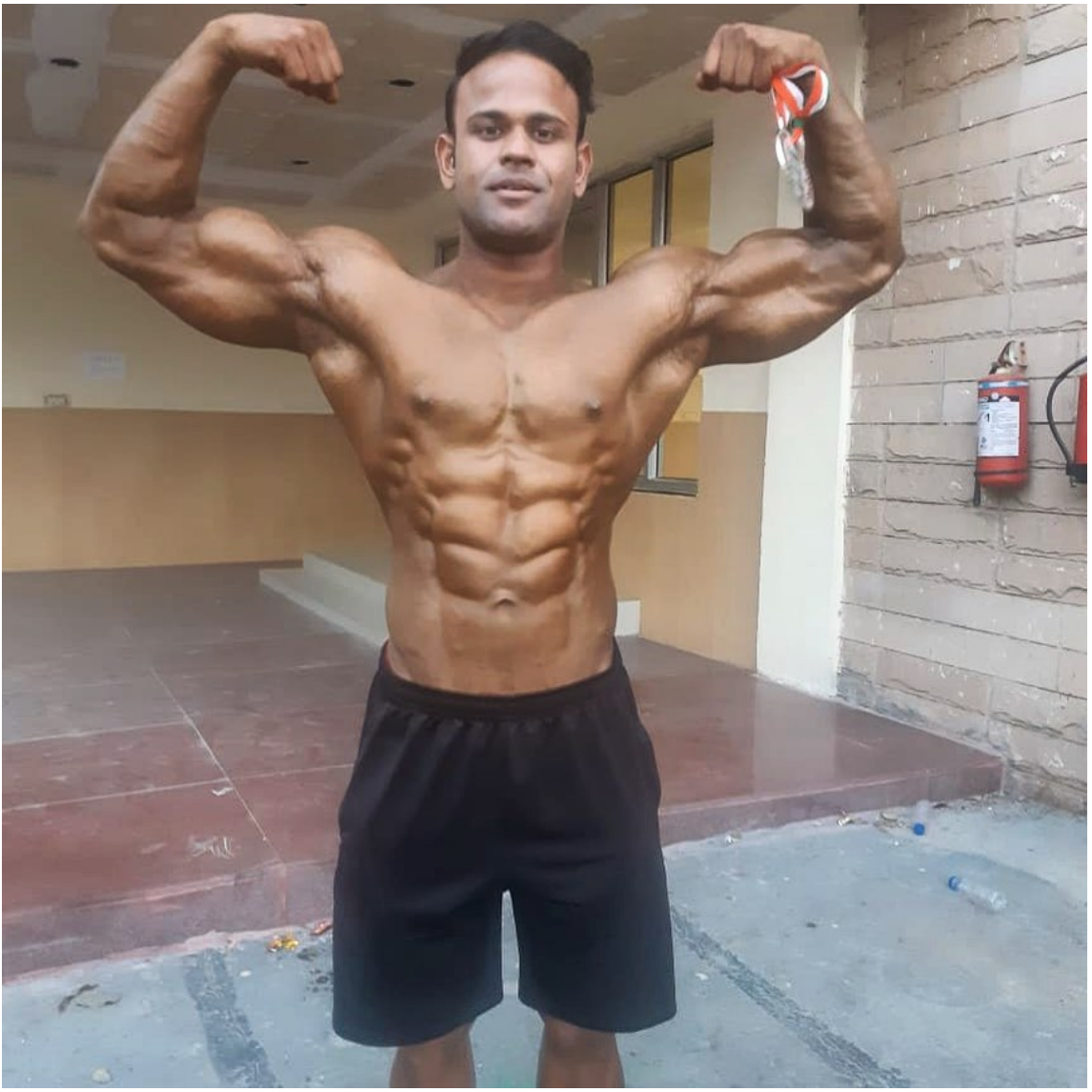
What is Drostanolone Propionate by Hilma Biocare? Drostanolone Propionate by Hilma Biocare is a very high quality anabolic and androgenic steroid (AAS) that is very famous and widely used in bodybuilding industry for various reasons that would be discussed here.. Drostanolone might be better known as Masteron - the most famous trade name for Drostanolone - the active substance in the compound.