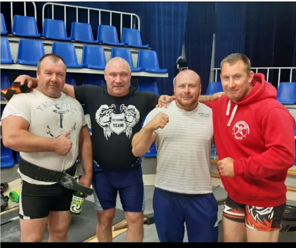
#bodybuildingmotivation #gym #gymshark #gymmotivation #gymlife #diet #powerlifting #fitness #getbig #train #workout #cardio #goldsgym #strength #muscle #squats #deadlift #protein #legday #keto #vegan #athlete #bulkingseason #cuttingseason #carnivore #foodie #gymmemes