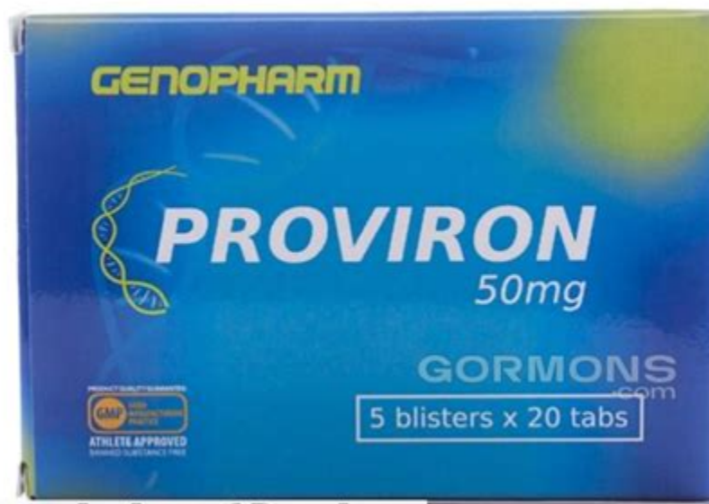
Description of Proviron