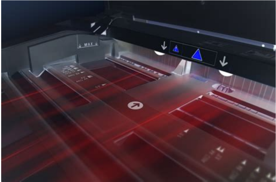
Courtesy of Maksim Atayants & Maksim Atayants's Workshop. Four-kilometer long embankments will cross the city in much the same way as the Seine river divides Paris into Right and Left Banks.