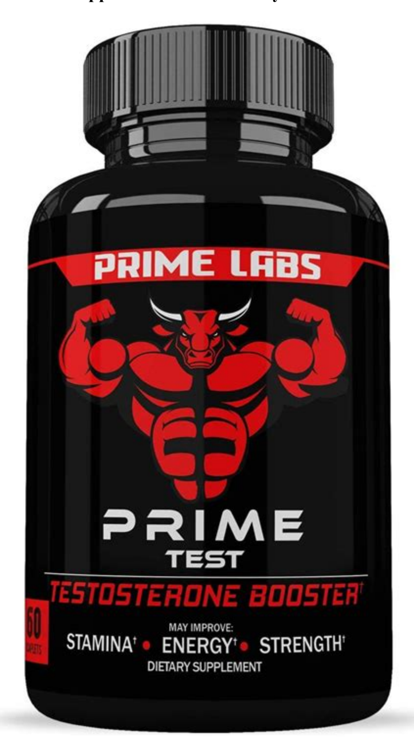
The 7 Best Testosterone Supplements of 2024 - Verywell Fit

Testosterone replacement therapy is available in several forms. All can improve testosterone levels: Skin patch (transdermal). Androderm is a skin patch worn on the arm or upper body. It's applied .