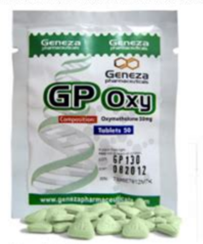
GP Oxy 50 mg Geneza Pharmaceuticals steroids UK. 50 tabs - $1.43

GP Oxy is an oral steroid which contains 50 mg of the hormone Oxymetholone