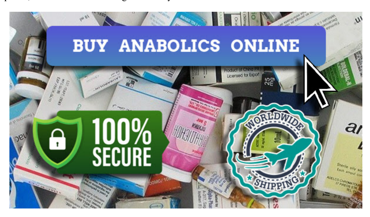
Ϋ́?Ϋ́?Ϋ́? CLICK HERE TO SHOP ONLINE Ϋ́?Ϋ́?Ϋ́?

Contact McKesson Medical-Surgical. (855) 571-2100. Request an Account. Shop Medical Supplies. As ambulatory and post-acute care evolve, make sure your healthcare facility has the tools and resources to grow along with it. As the nation's largest distributor of wholesale medical-surgical supplies and equipment, McKesson Medical-Surgical is ready.