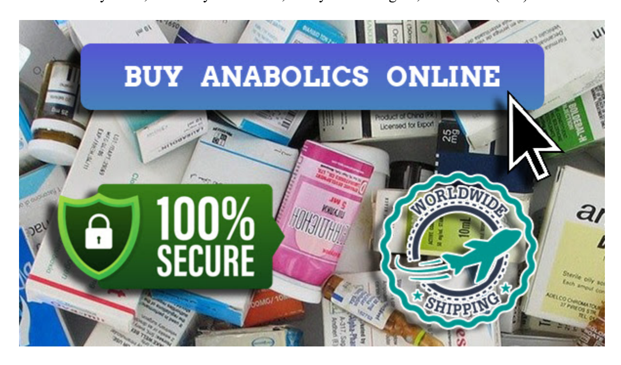
$?$?$ ? BUY ANABOLICS ONLINE $?$?$ ?

UVELKA TM (RESURS LLC) Resurs LLC (Uvelka trademark) is a modern grain processor and manufacturer of high quality boil-in-bag cereals, cereal flakes and instant oats with fruit and berries. 59, Zheleznodorozhnaya Str., Uvel'skiy Settlement, Chelyabinsk Region, Russia. +7 (351) 211-6000.