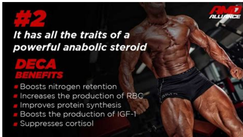
Table of Contents What is Deca-Durabolin (Nandrolone)? Deca has a half life of between 6 and 12 days and a very long detection time of about 18 months; something to keep in mind if you are a professional or competitor. Nandrolone Decanoate Structure