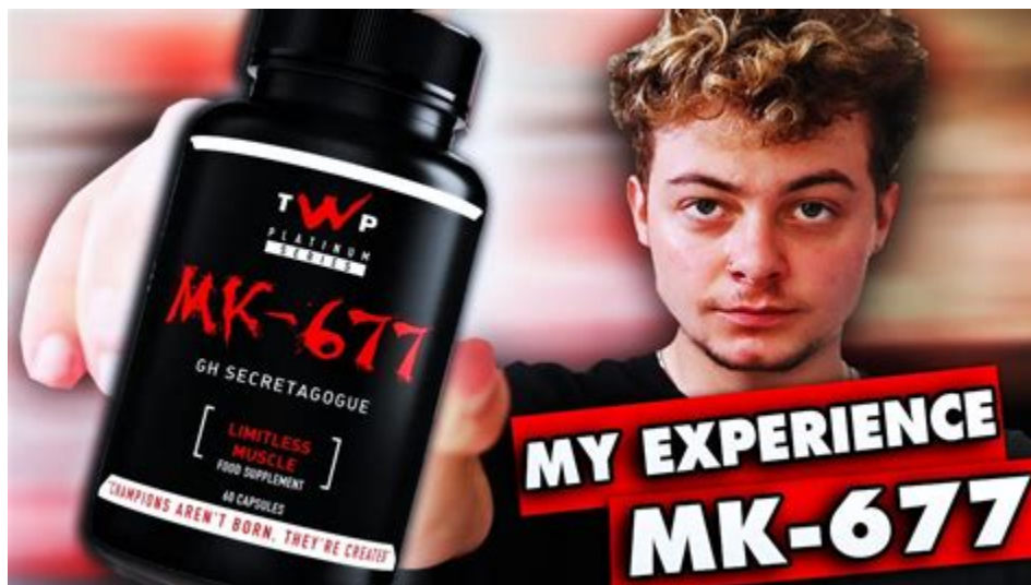
Table of Contents What is MK 677 Some people mistake MK 677 for a SARM (Selective Androgen Receptor Modulator). In reality, it's actually not a SARM at all, it's a growth hormone secretagogue. This means that it will promote the production of GH (Growth Hormone) and IGF-1 (Insulin-like Growth Factor 1) in the body.