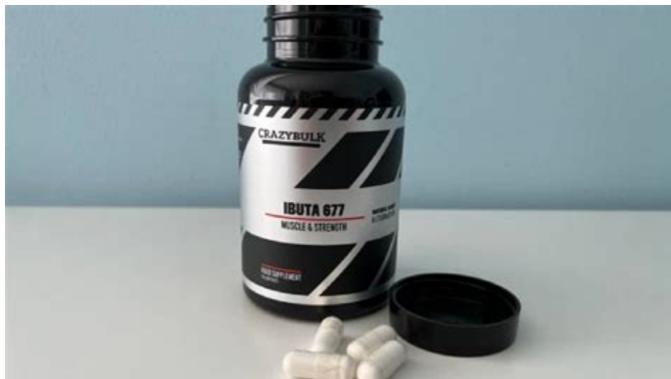
TABLE OF CONTENTS What is MK 677? How does Ibutamoren work? MK-677 benefits Helps build muscle Reduces muscle wasting Improves sleep No suppression of testosterone MK 677 side effects Water retention Increased hunger Reduced insulin sensitivity MK 677 Dosage and cycle length When to take MK 677 Ibutamoren cycle length How long does it take to work?