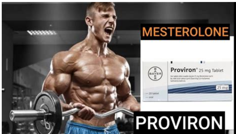
Table of Contents What is Proviron? Proviron is the brand name of Mesterolone which was developed medically to treat hypogonadism in men which causes low testosterone. Although it is sometimes loosely considered to be an AAS (androgen and anabolic steroid), it contains little anabolic capacity and