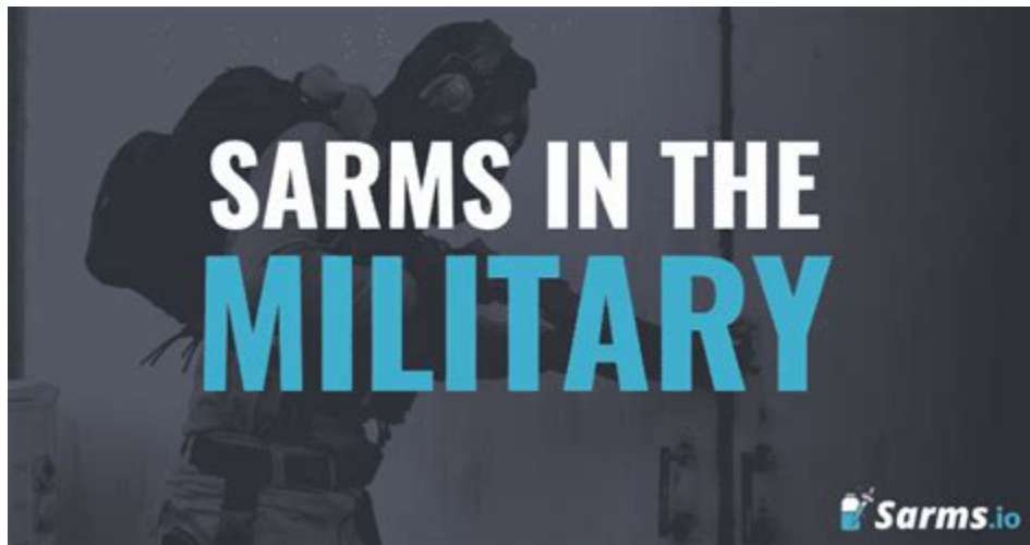
Table of Contents Are SARMs Allowed In The Military SARMs are currently in a legal grey area, but that doesn't mean that you won't get in trouble with your CO if he finds out you were using them. The military has to submit to the Government, since it gets most of its funding from it.