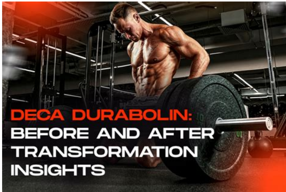
Table of Contents Deca for bodybuilding is what most athletes and bodybuilders use to increase their strength and size. When it comes to bodybuilding, there are a lot of different products on the market that claim to be able to help you achieve your goals. One of these products is known as Deca Durabolin, which is a type of anabolic steroid.