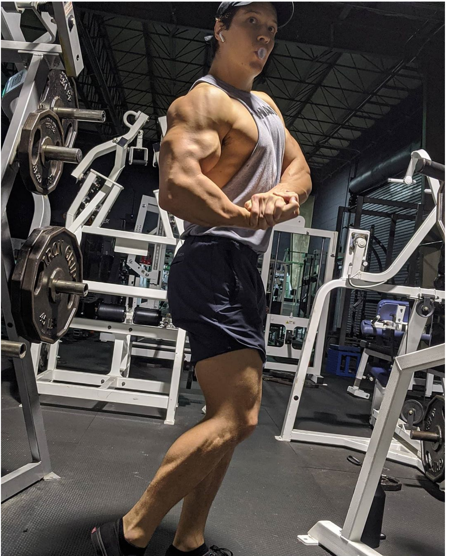
Masteron enanthate (Drostanolone) is a dihydrotestosterone (DHT) derivative that is altered by the addition of a methyl group at the carbon 2 position to increase its anabolic effects. It is a very popular anabolic steroid due to it displaying moderate anabolic and low androgenic characteristics.