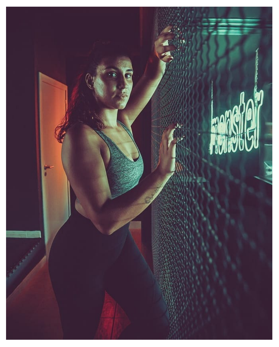
We offer several reputable Testosterone brands like Watson, Alpha Pharma, Pharmacom, Balkan Pharma and others. Our customers usually buy 250mg/ml dosages (the most popular choice of Test Cypionate during Testosterone cycle or during TRT). Delivery of injections to USA takes from 5 to 15 business days. How to 'Self-Love': workout, eat healthy, practice virtues, defend values, seek challenges, speak truth, accept responsibility. Self-love is earned not wished