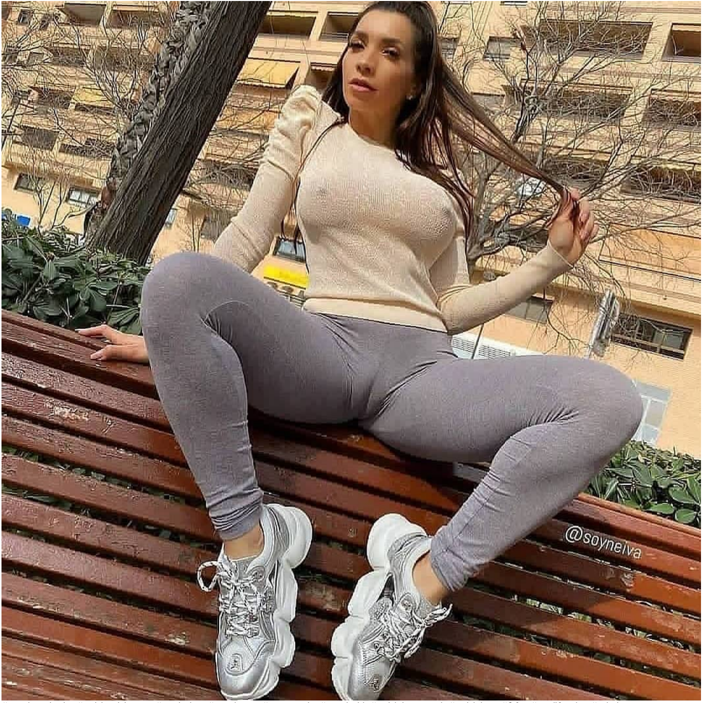
#musclemotivation #weightgainjourney #runninglove #musclemass #progresspics #musclegirls #weightlossstruggle #weightlosss #fitfam #gymlifestylers #caloriescount #chestworkouts #progressdaily #fitgirlsfam #gainster #fitfaminstagram #leanstrength #weightlossroutines #caloriedefecit #weightgaining #progressphotos #progressvideo #musclesandcurves #musclescience #chestgains #musclesoreness #sixpackchallenge #gainsbro