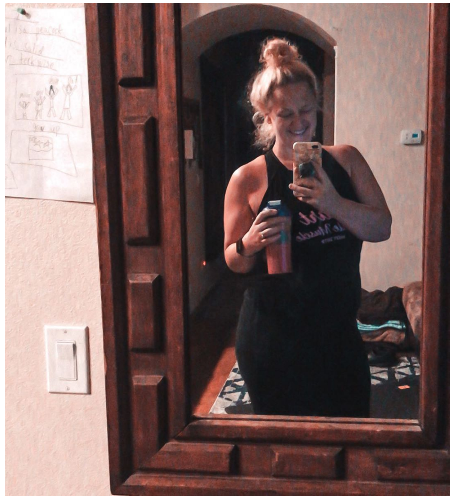
#love #mujeres #tendencias #faldas #muscles #tienda #outfits #colombia #nuevanormalidad #verano #tiendavirtual #cali #envios #compras #like #newnormal #newcollection #newarrivals #boutique #follow #belleza #instacali #yumbo #compralocal #yumbopolis #solbluelovers #edificioruta53 #compracolombiano #yumbo