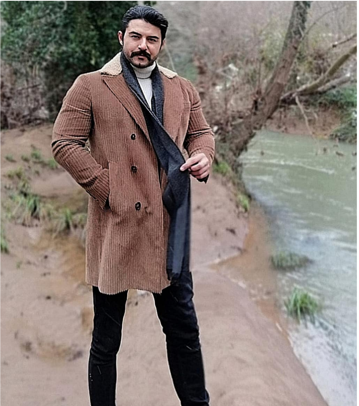
#fitlife #noexcuses #nofilter #training #weights #igers#instagym#srilanka #tbt #diet #instagood #photooftheday #work #sport[... ]#IFBB #WBFF #love #npc #nutrition